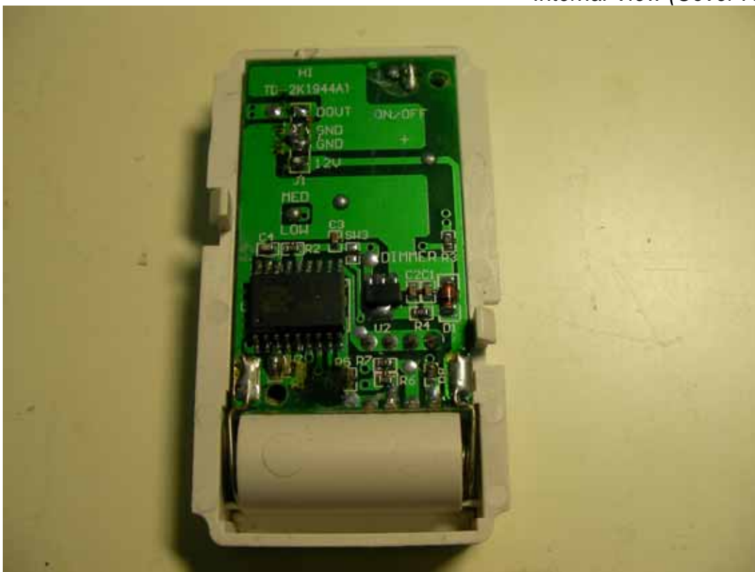
Photo 4 Internal View