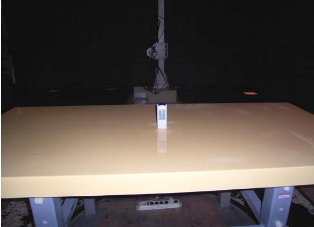
EUT on Side