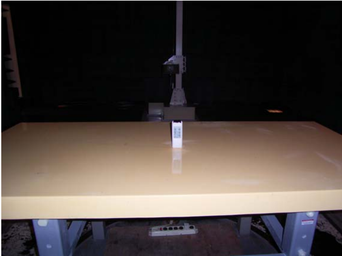
EUT on Side