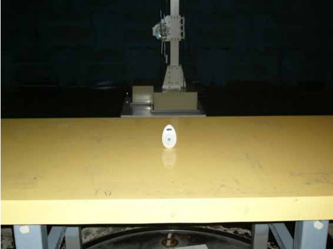
EUT on Side