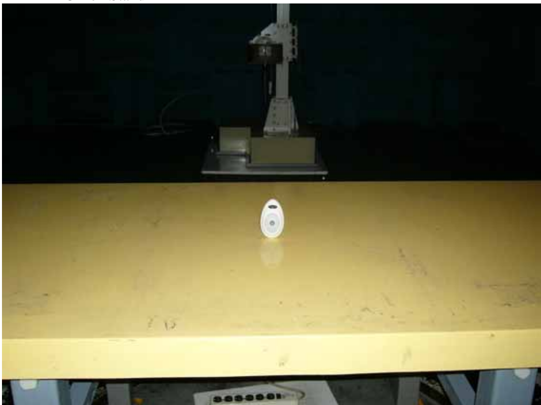
EUT on Stand