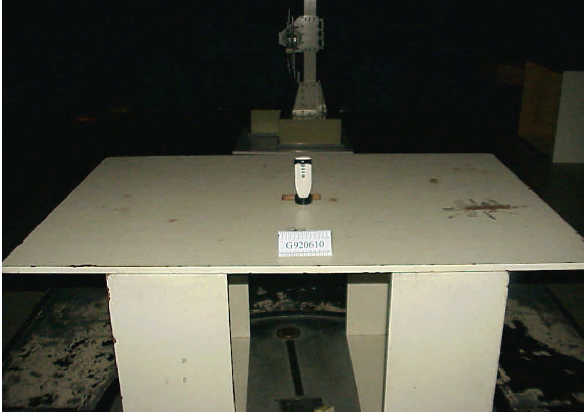
EUT on Side