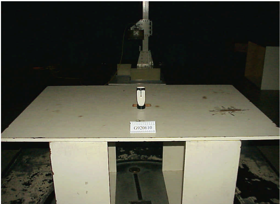
EUT on Stand