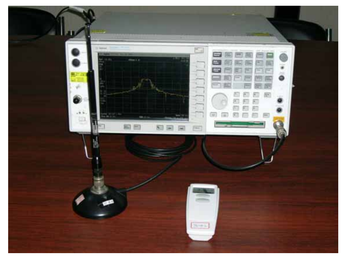
8.3.Photo of Emission Bandwidth Measurement

8.4.Photo of Periodic Operated Measurement