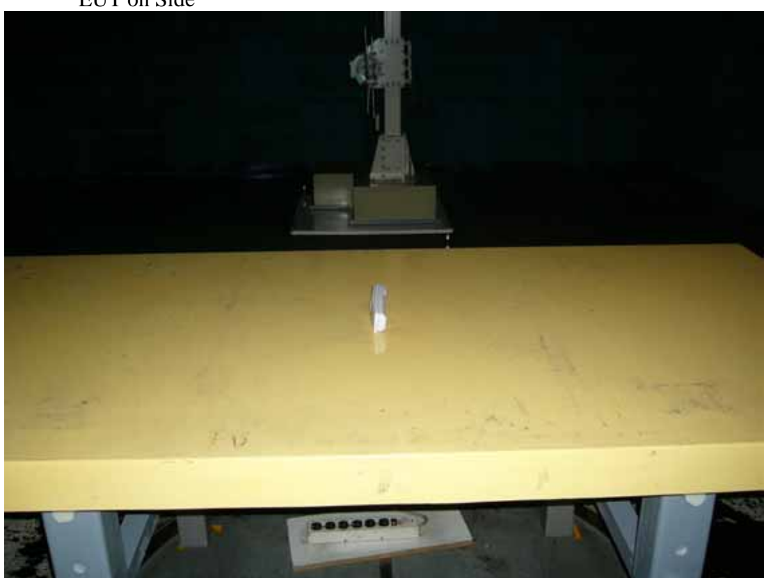
AUDIX Technology Corporation Report No.: EM-F980989

8.1.Photos of Radiated Measurement at Semi-Anechoic Chamber (30~1000MHz) EUT on Stand