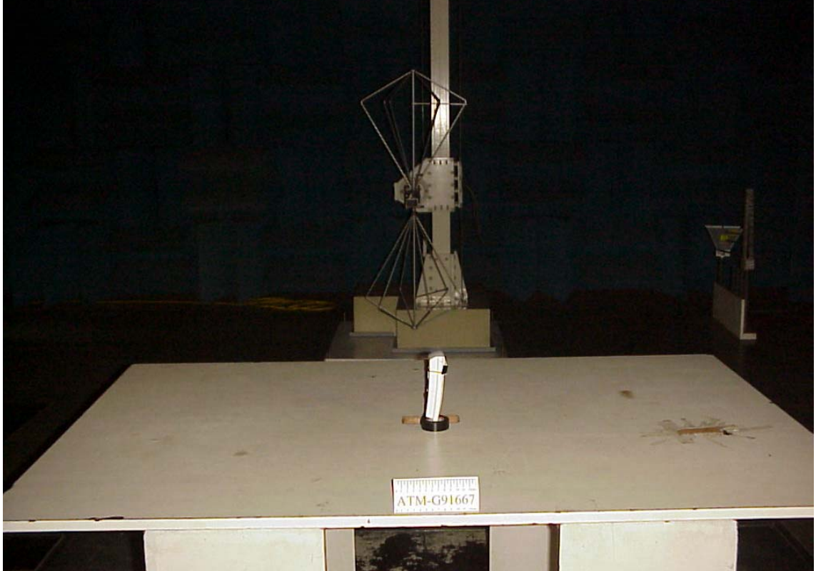
EUT on Side