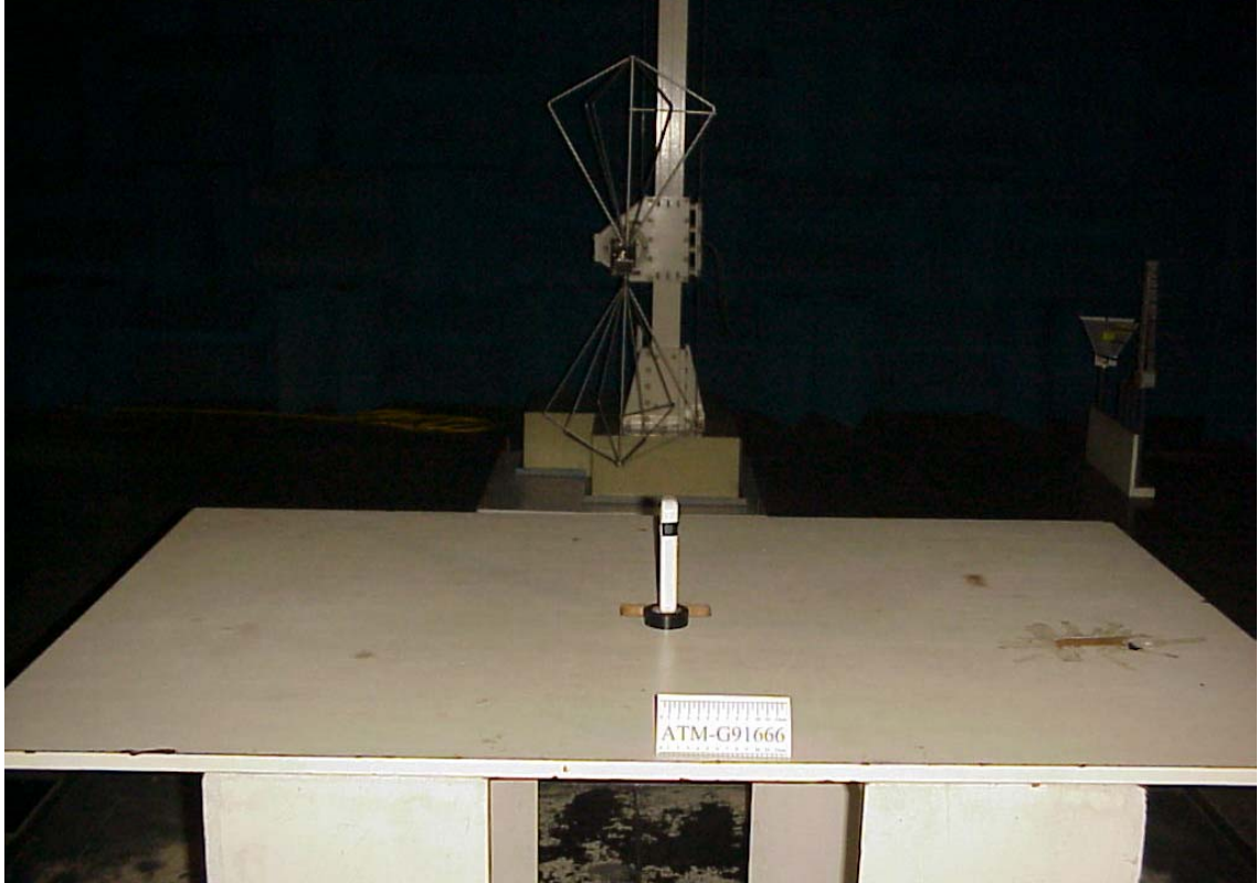
EUT on Side