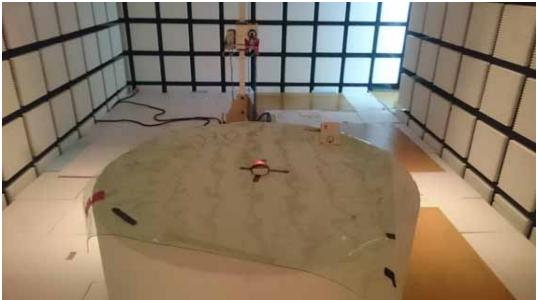
EUT on Lie