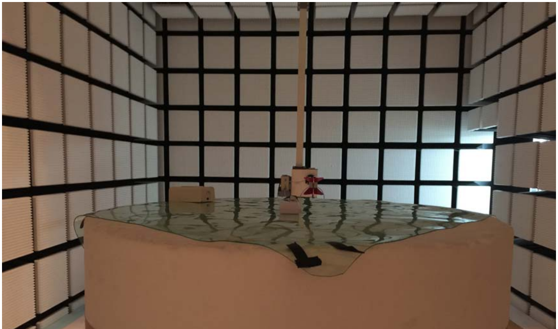
EUT on Lie