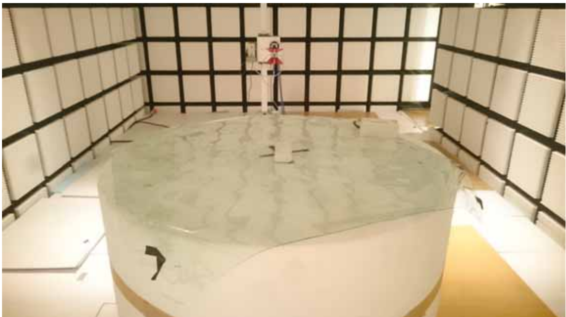
EUT on Lie