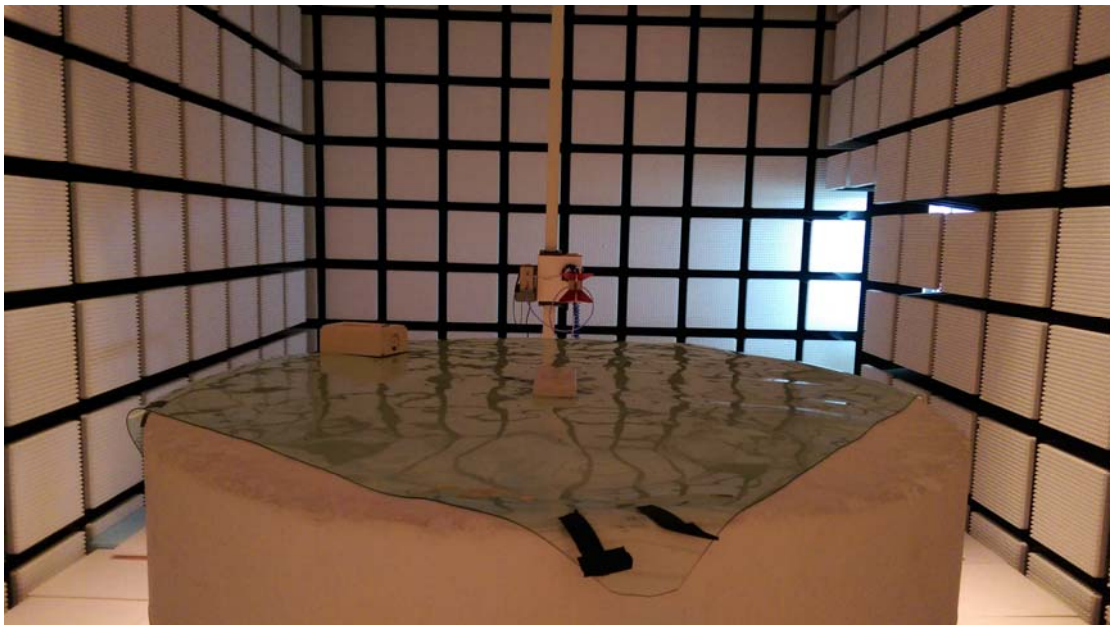
EUT on Lie