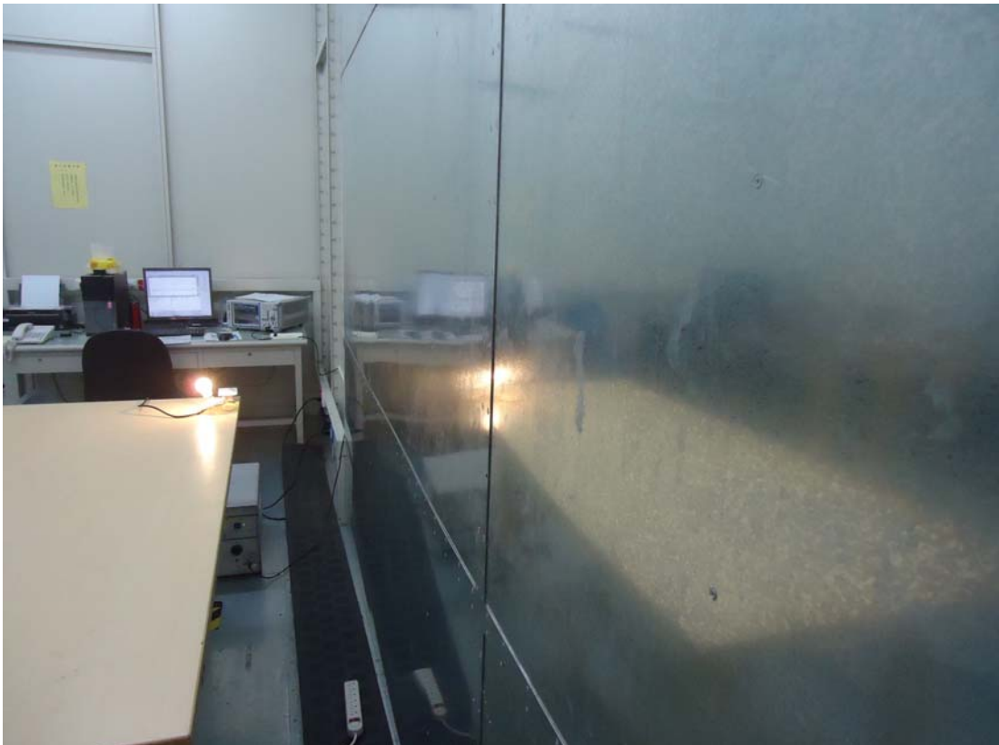
BACK VIEW OF CONDUCTED MEASUREMENT