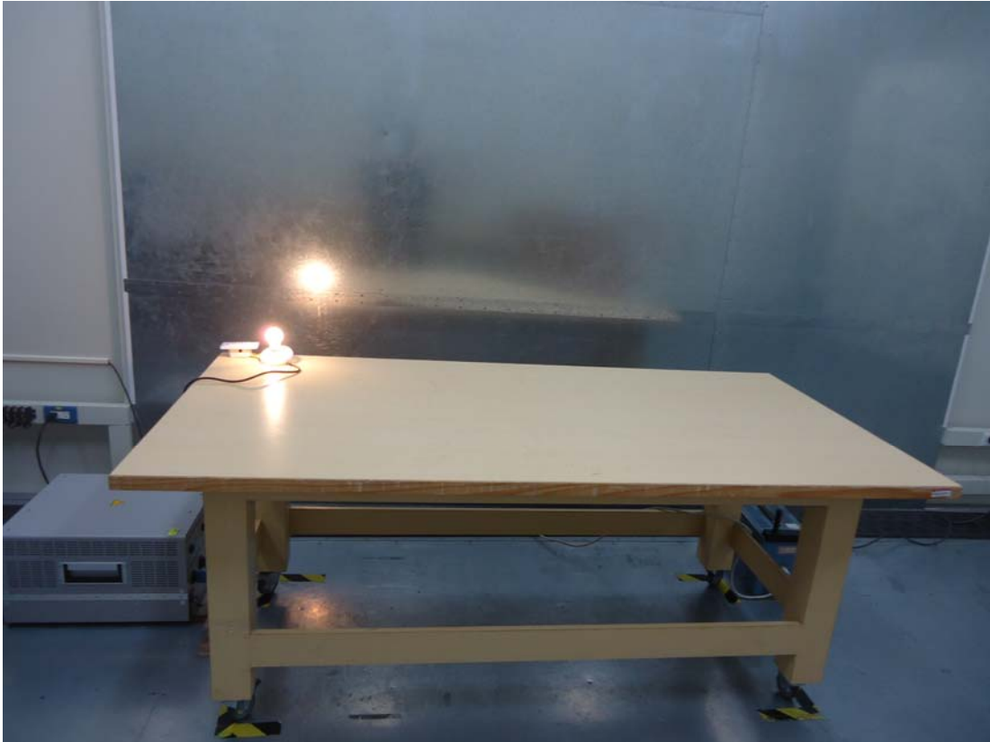
FRONT VIEW OF CONDUCTED MEASUREMENT