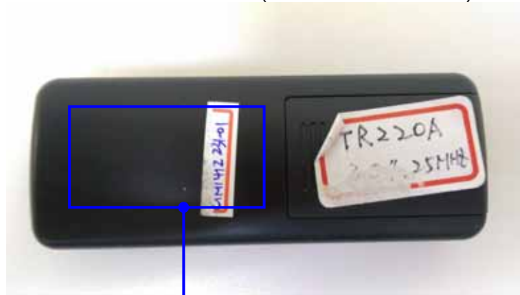
ID Label Placement Location