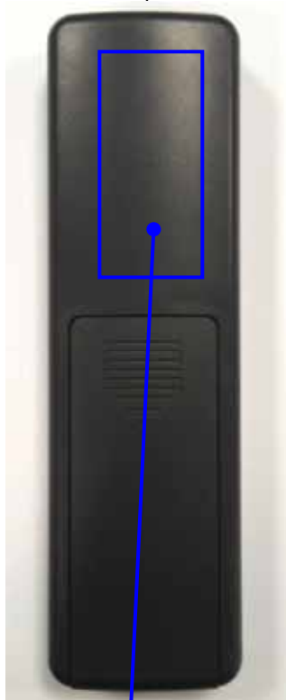
ID Label Placement Location