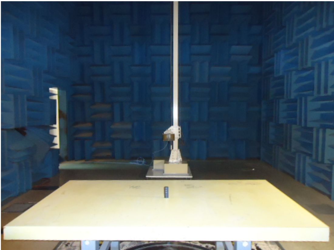
EUT on Stand