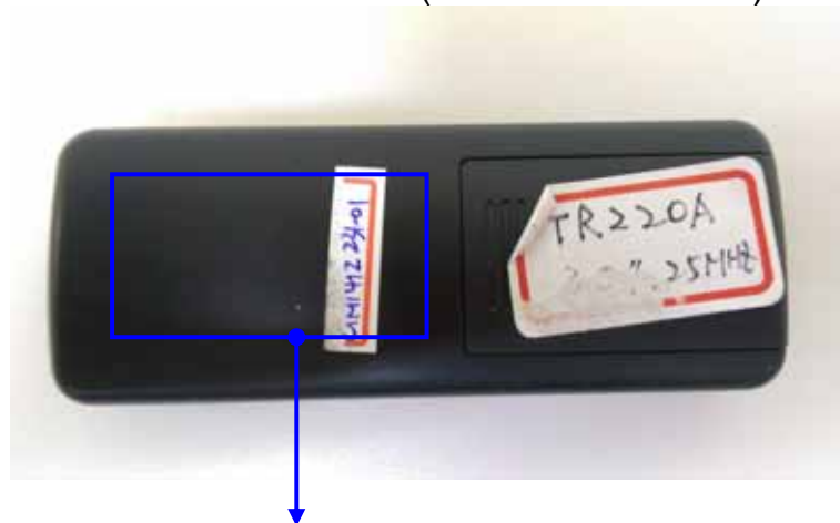
ID Label Placement Location