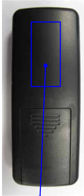
TR221A ID Label Placement Location