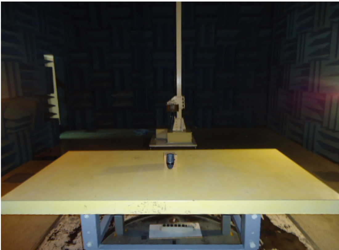
EUT on Stand