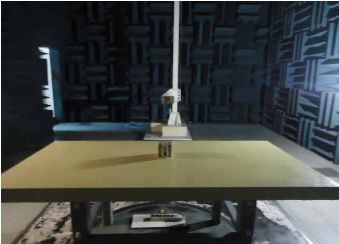
EUT on Stand