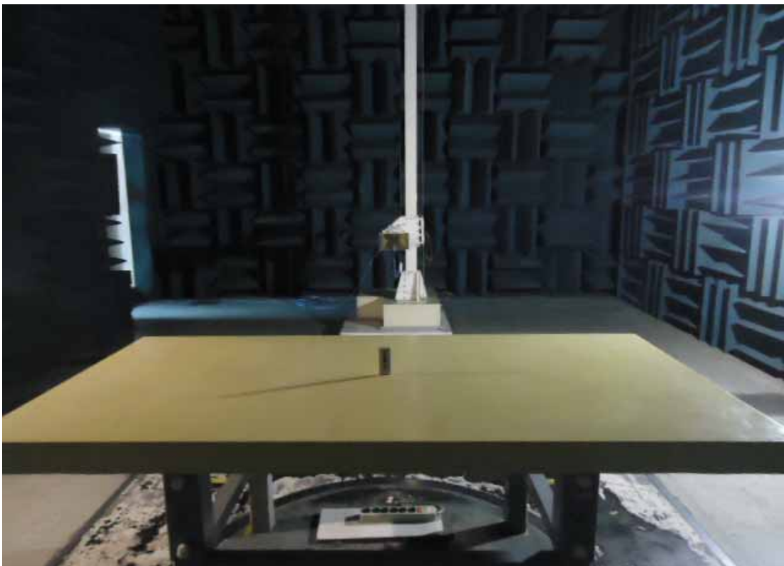
EUT on Stand