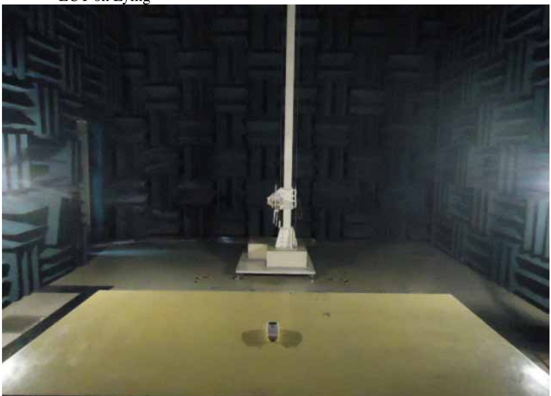
8.2. Photos of Radiated Measurement at Semi-Anechoic Chamber (Above 1GHz)