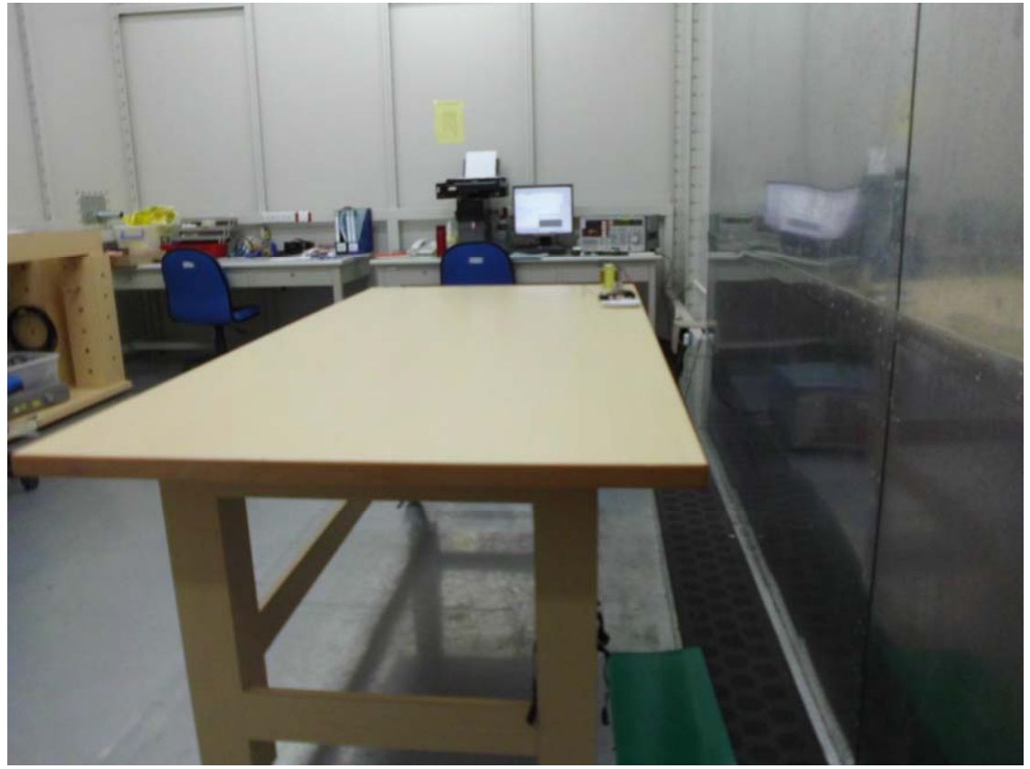
BACK VIEW OF CONDUCTED MEASUREMENT