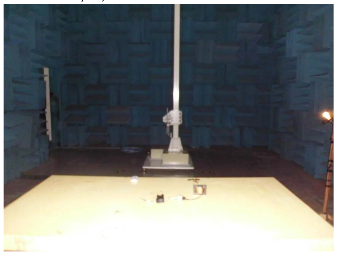
10.2.2. Frequency Above 1GHz