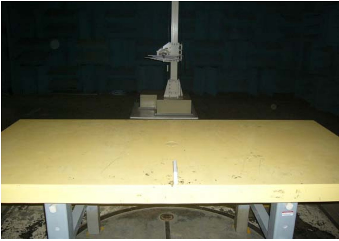
AUDIX Technology Corporation Report No.: EM-F1000937