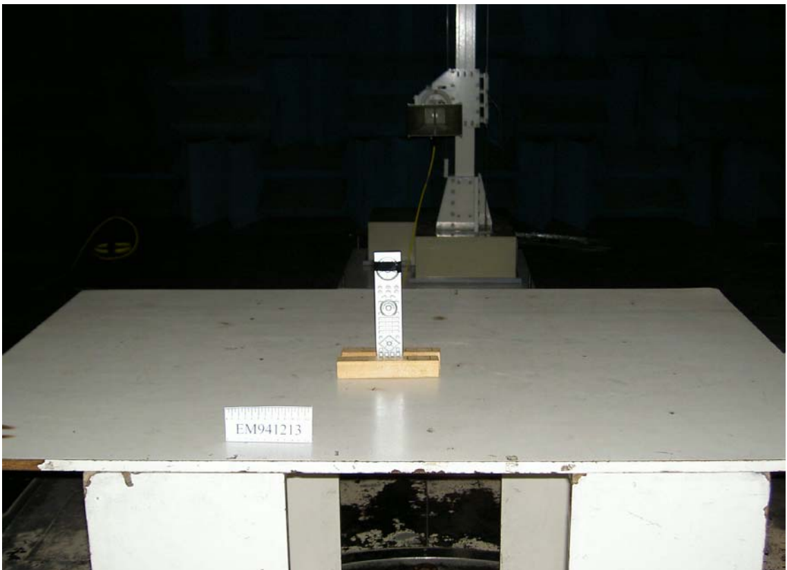
EUT on Stand