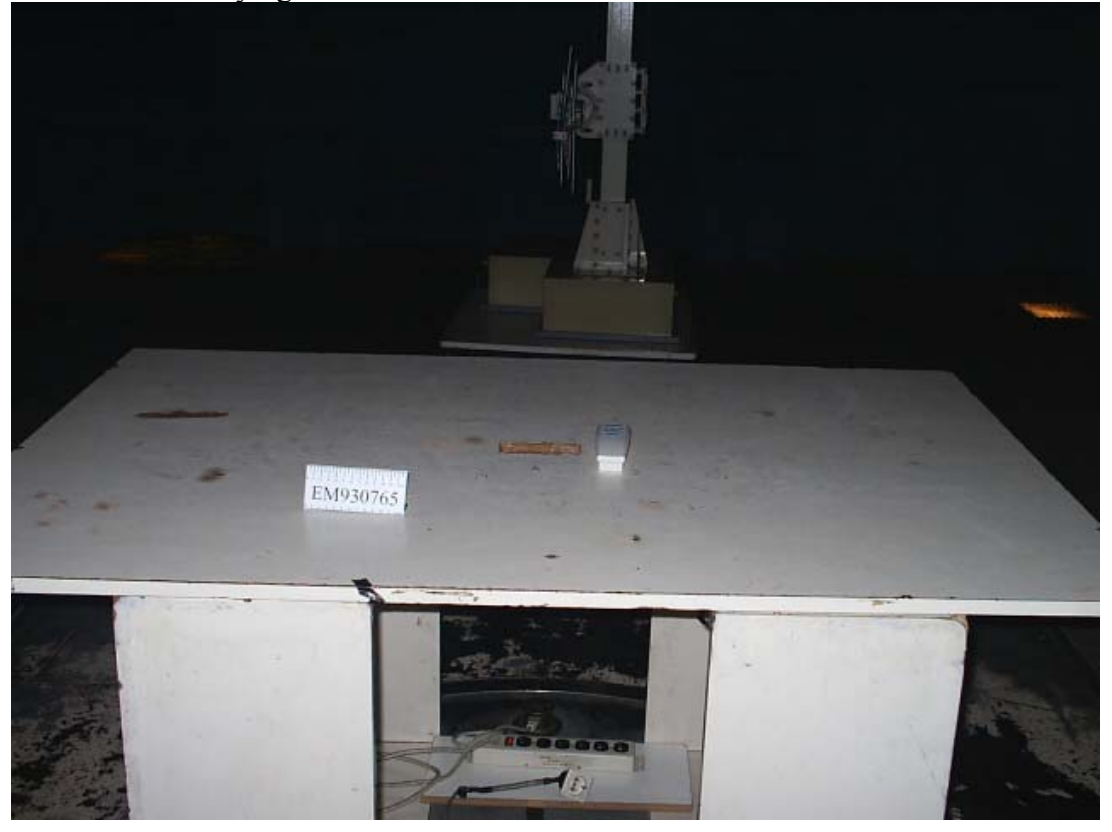
7.2.Photos of Radiated Measurement at Semi-Anechoic Chamber (Above 1GHz) EUT on Stand