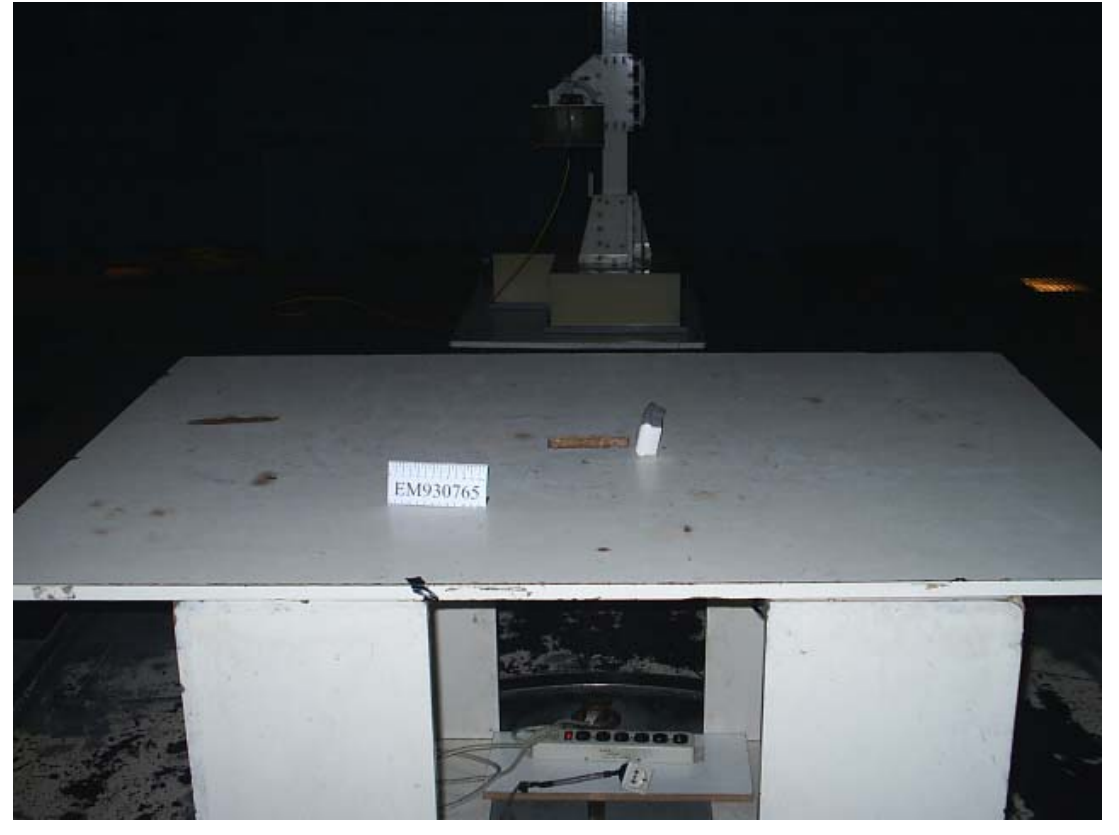
EUT on Lying