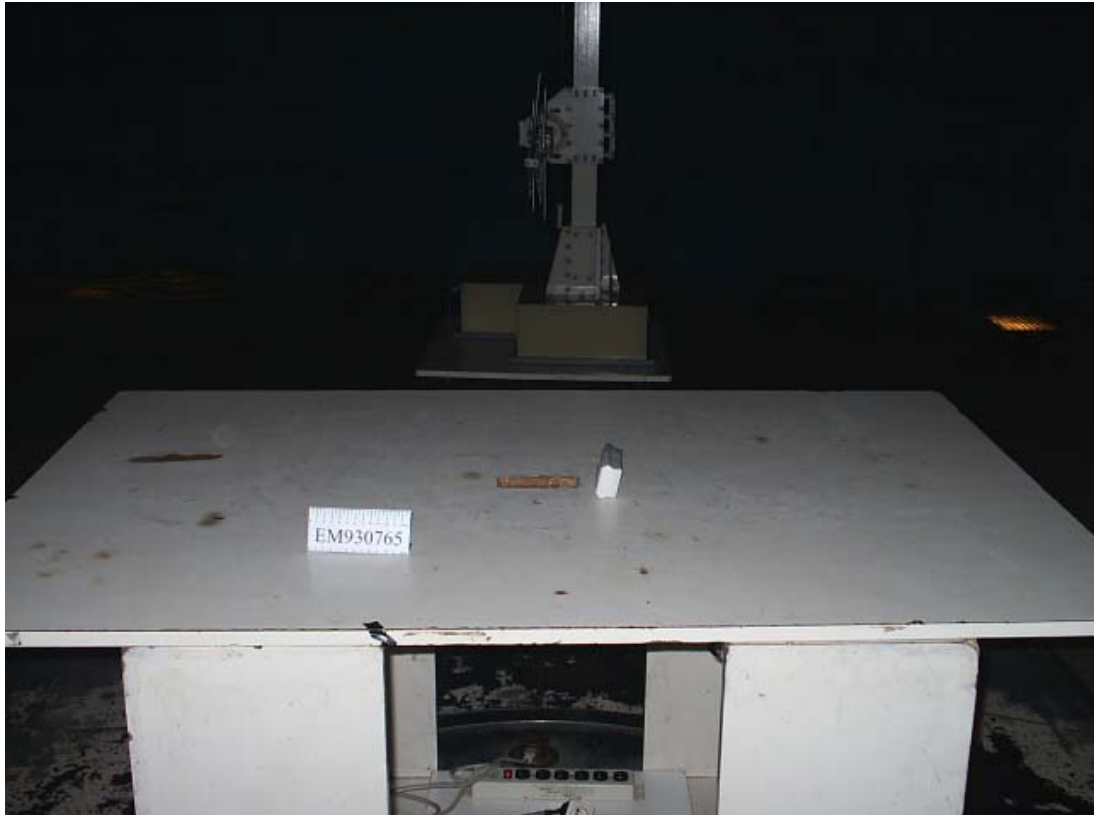
Audix Corporation Report No.: EM-F930135