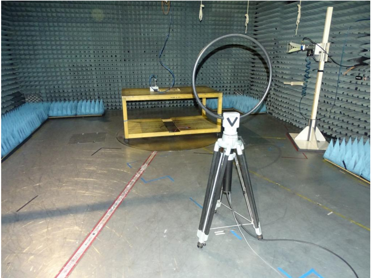
Photo 1: Test setup for radiated measurements (Enclosure, below 30 MHz, intentional radiator §15.209, ANSI C63.10)