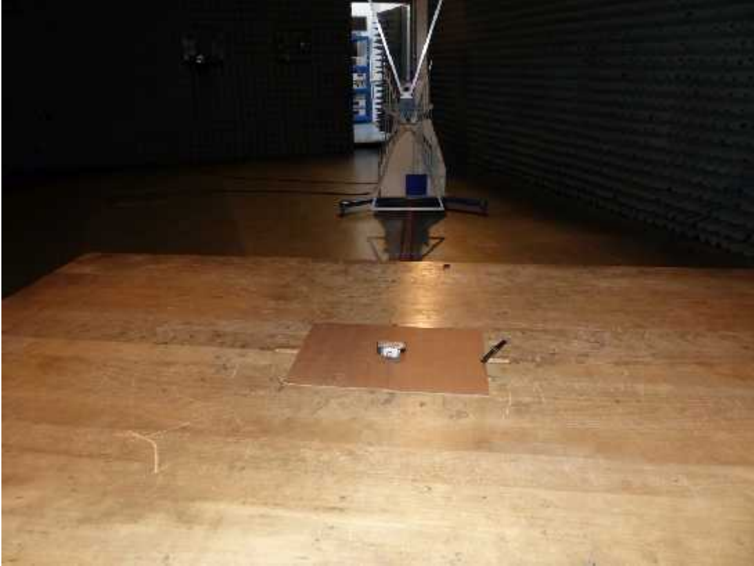
Photo 3, 4, 5: Test setup for radiated measurements, EUT in vertical position Enclosure, semi-anechoic chamber, 30 MHz to 1 GHz, intentional radiator §15