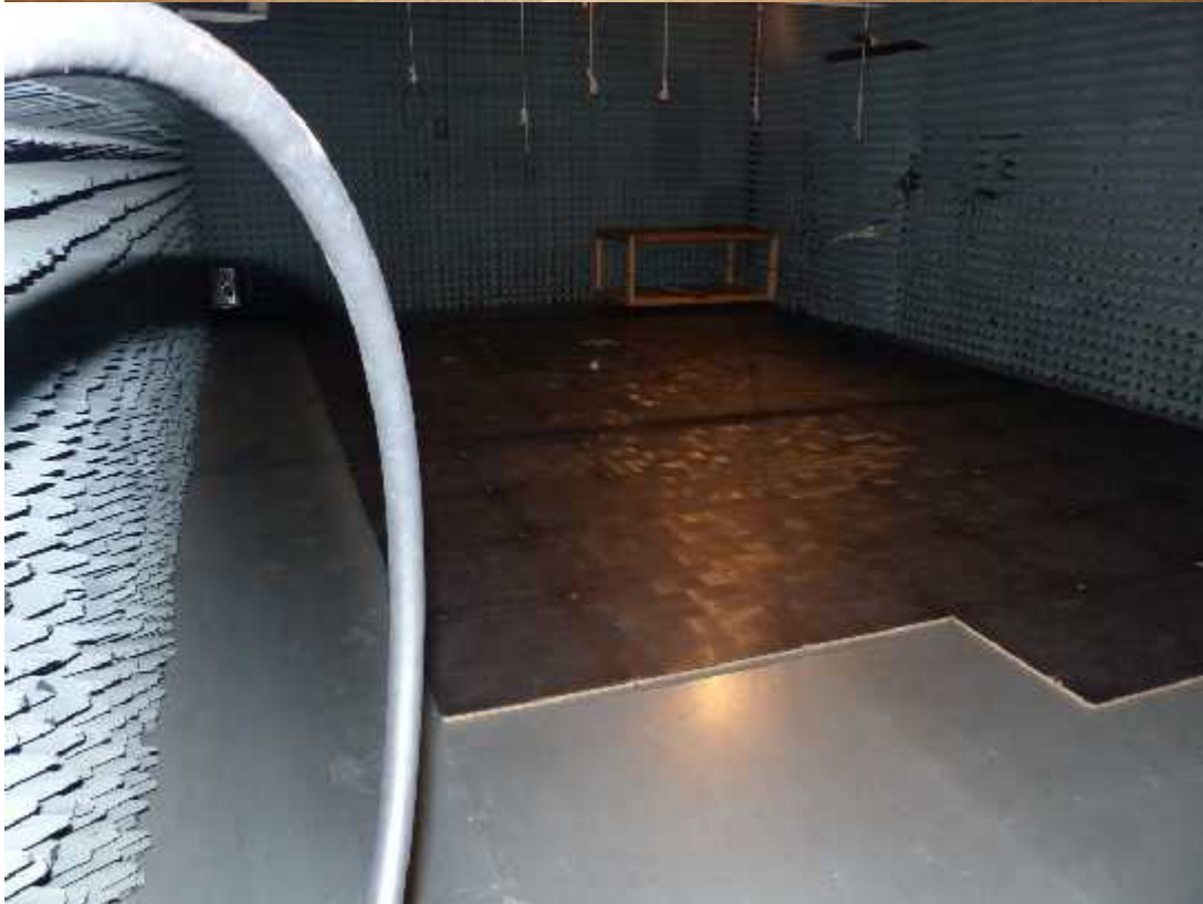
Photo 1, 2: Test setup for radiated measurements, EUT in horizontal position Enclosure, semi-anechoic chamber, below 30 MHz, intentional radiator §15