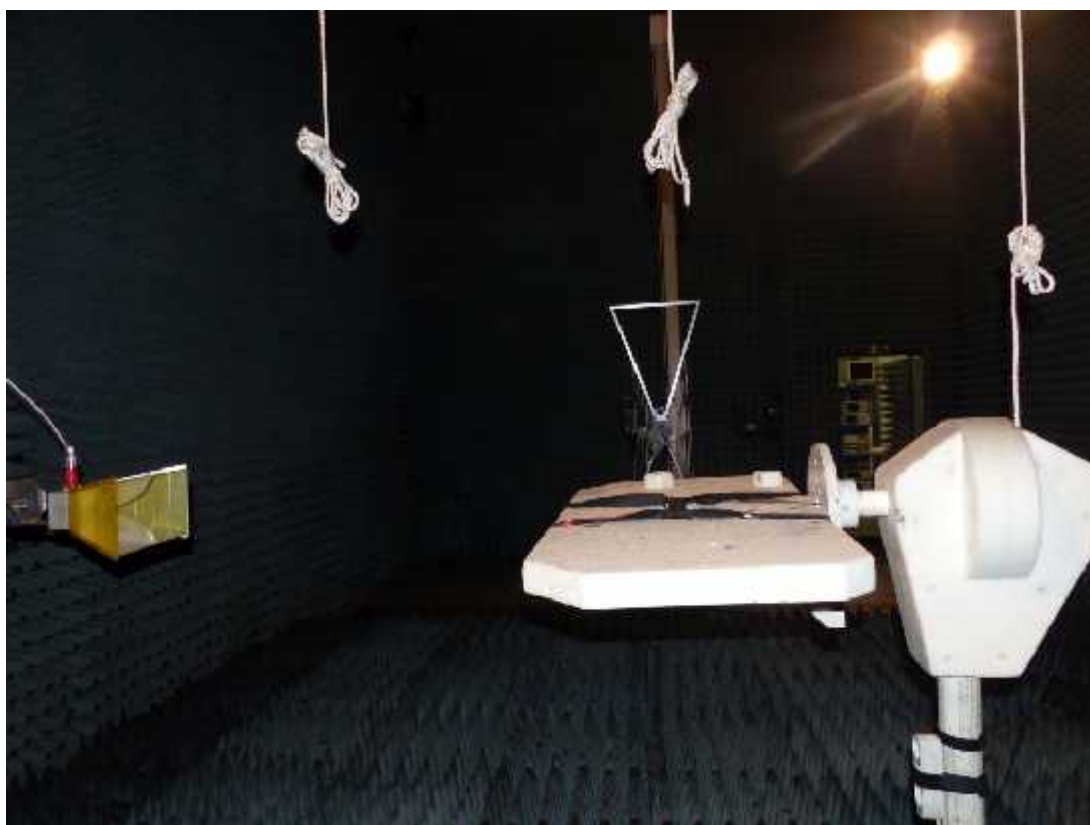
Photo 6, 7: Test setup for radiated measurements, EUT in horizontal position Enclosure, fully-equipped anechoic chamber, 1-4,5 GHz §15