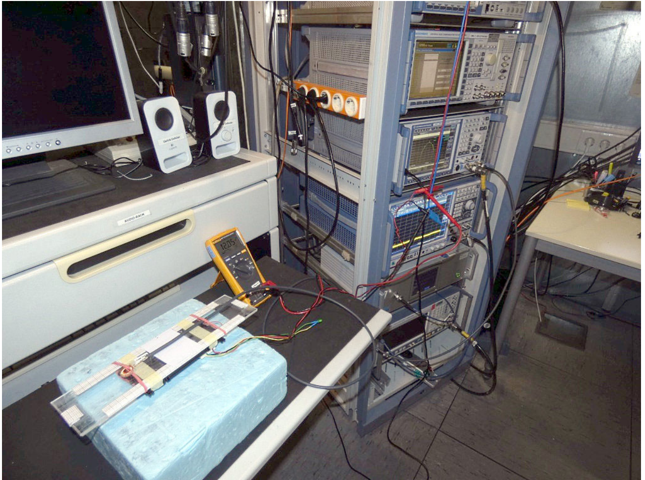
Photo 4: Test setup for conducted radio measurements (intentional radiator §15, ANSI C63.10)