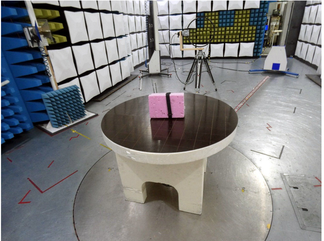
Photo 1: Test setup for radiated measurements (Enclosure, below 30 MHz, intentional radiator §15.209, ANSI C63.10)