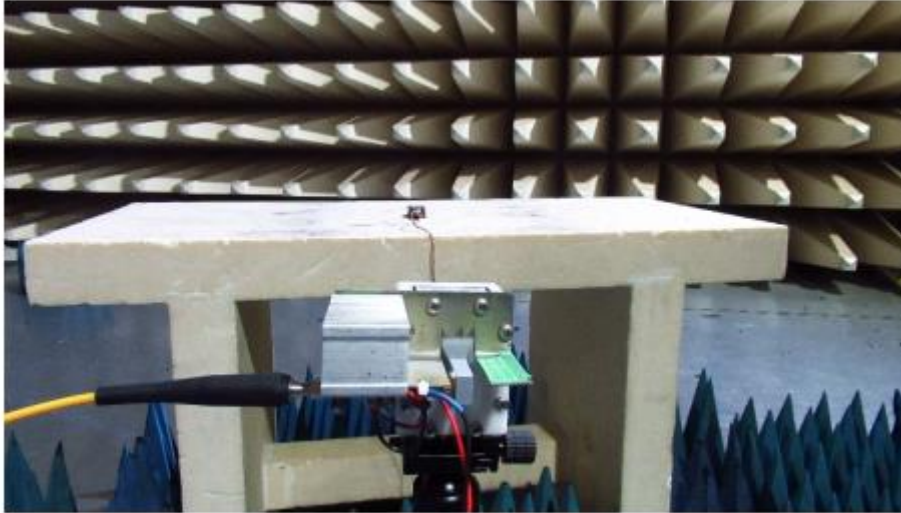
Peak Power Radiated