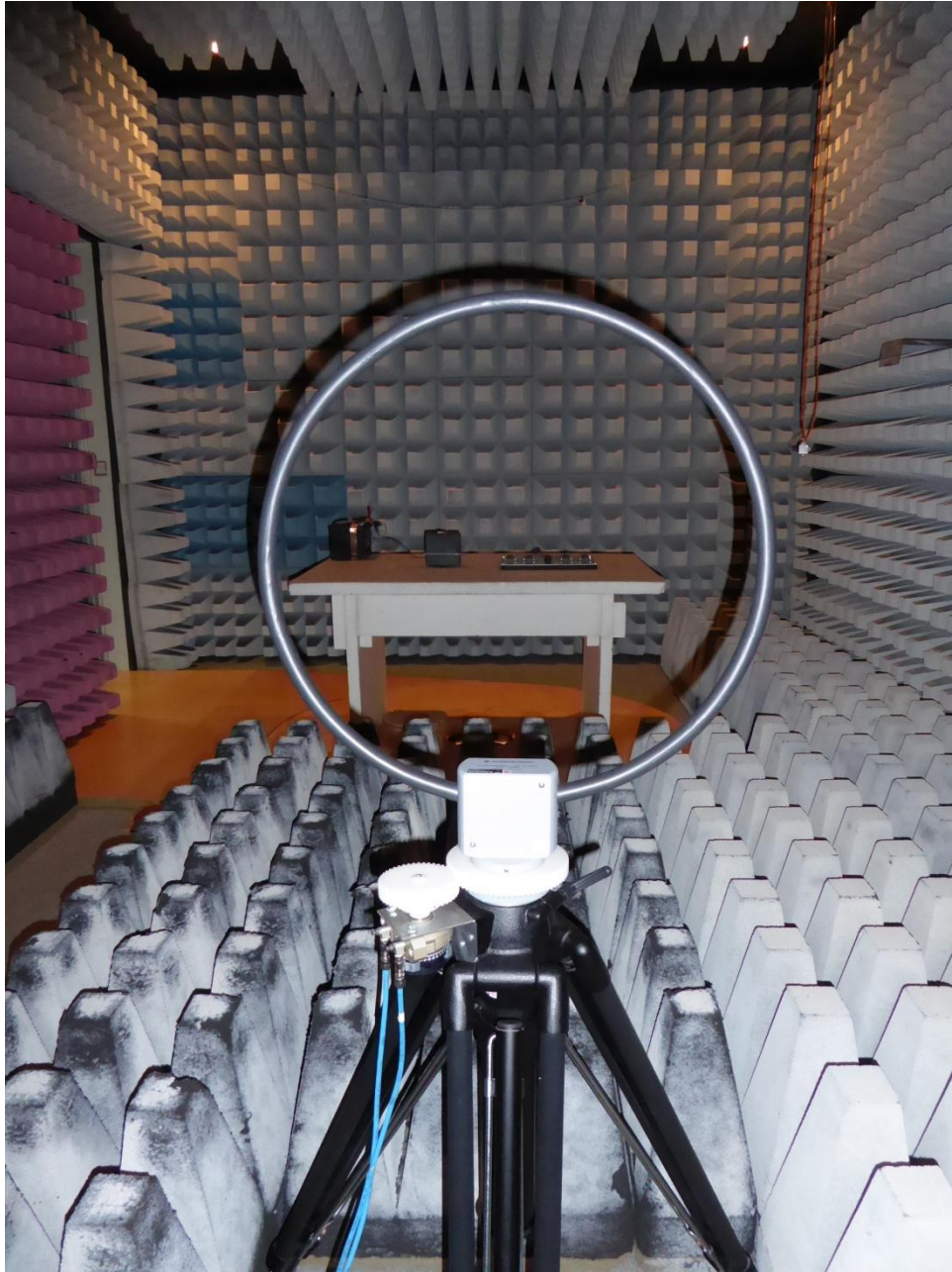
154295_20.JPG: Test setup fully anechoic chamber (9 kHz to 30 MHz)