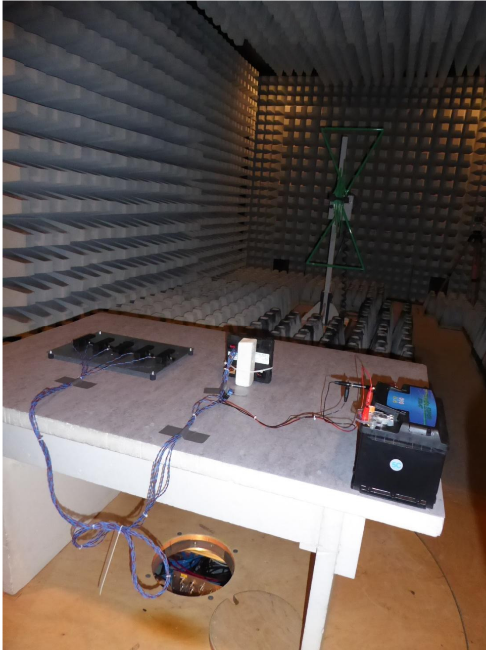
154295_20.JPG: Test setup fully anechoic chamber (30 MHz to 1 GHz)