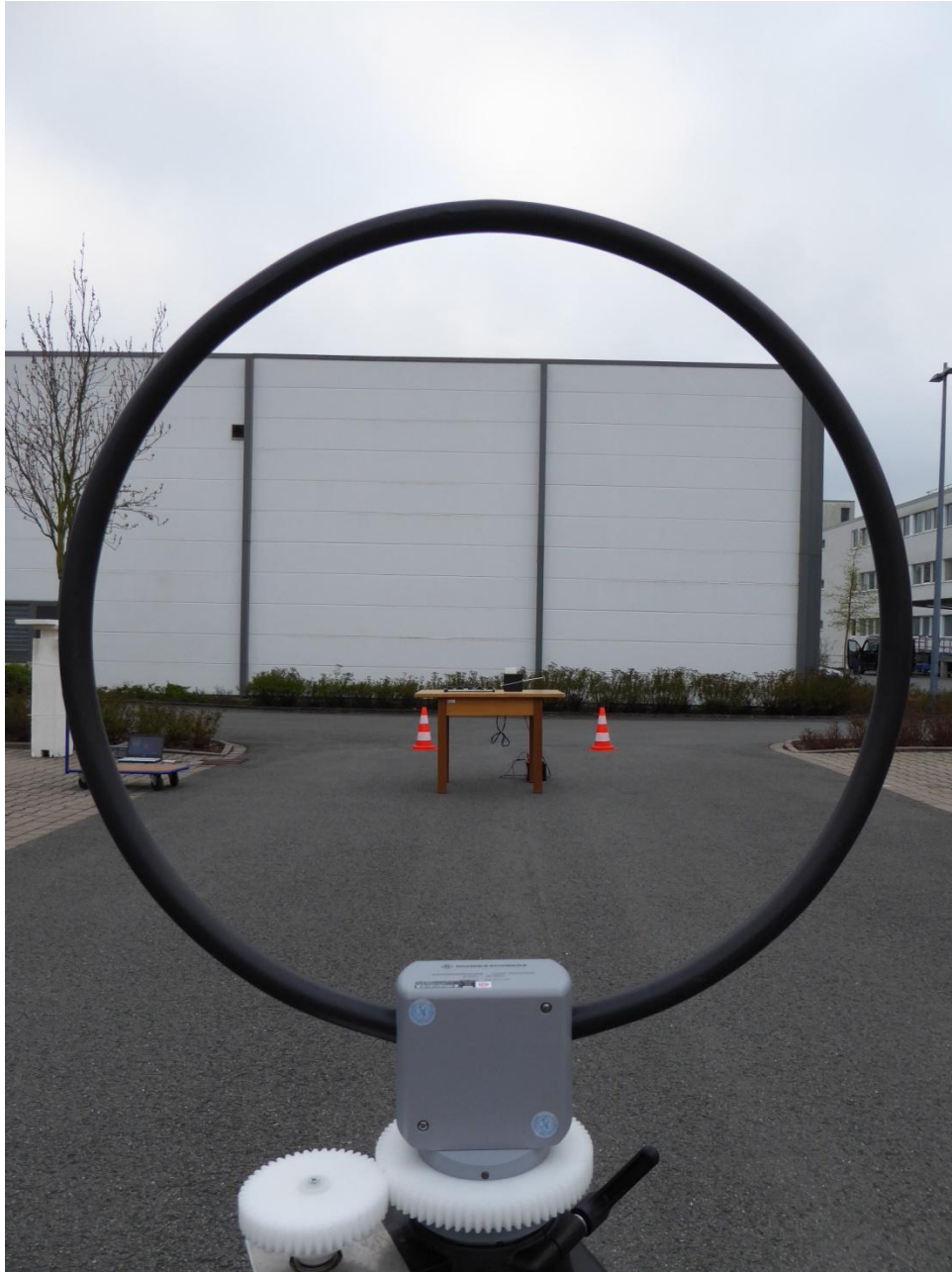
154295_23.JPG: Test setup outdoor test site (9 kHz to 30 MHz)