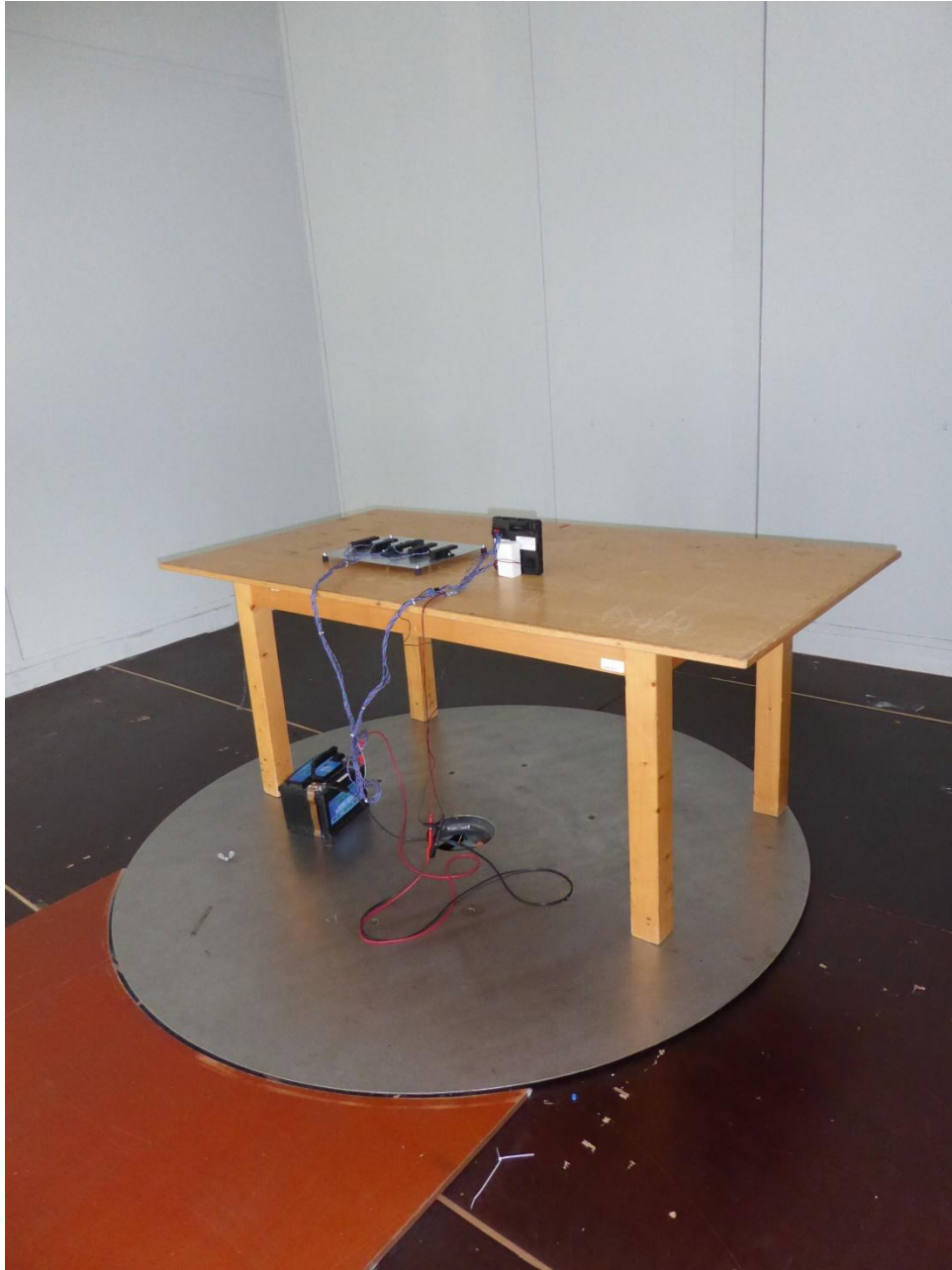
154295_24.JPG: Test setup open area test site (30 MHz to 1 GHz)