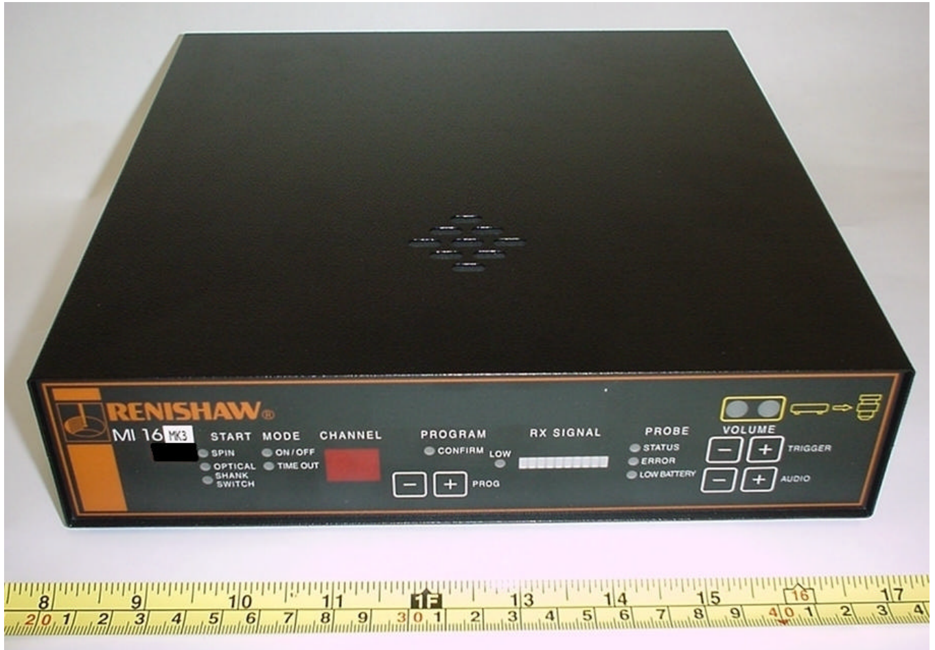
Title : Rx, front view.