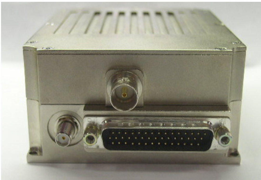
Figure 4 – Front view