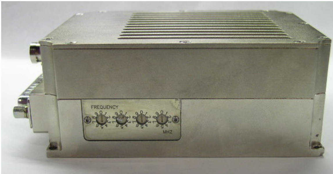
Figure 1 – Right side view with frequency select switches

Exhibit _ exterior of DUT MDT-B (figures 1 – 4).