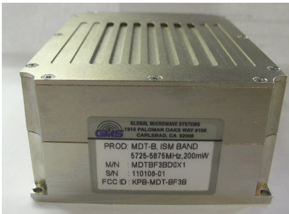
Figure 2 – Rear view with FCC ID label