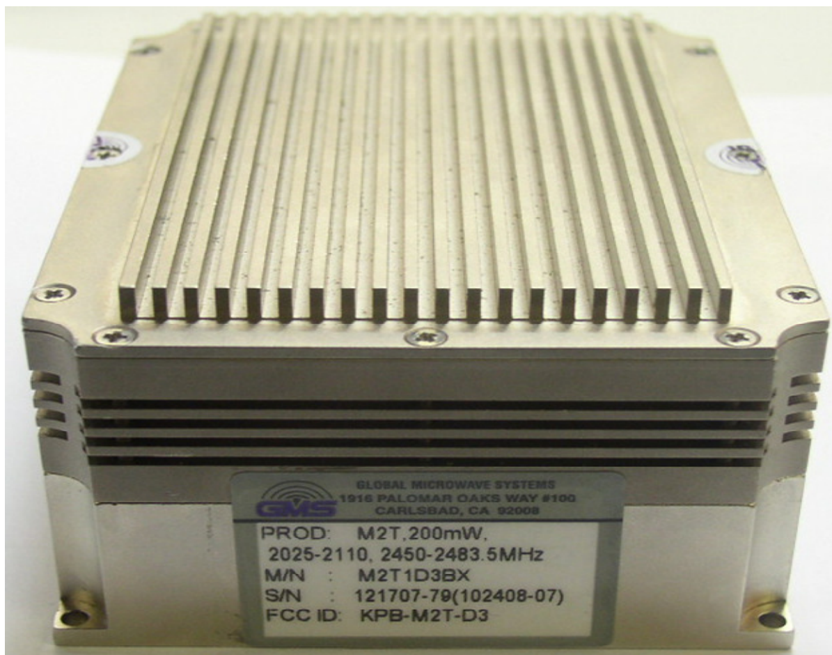
Figure 1 - Rear view with FCC ID label

Exhibit showing external pictures of DUT M2T (figures 1-4)