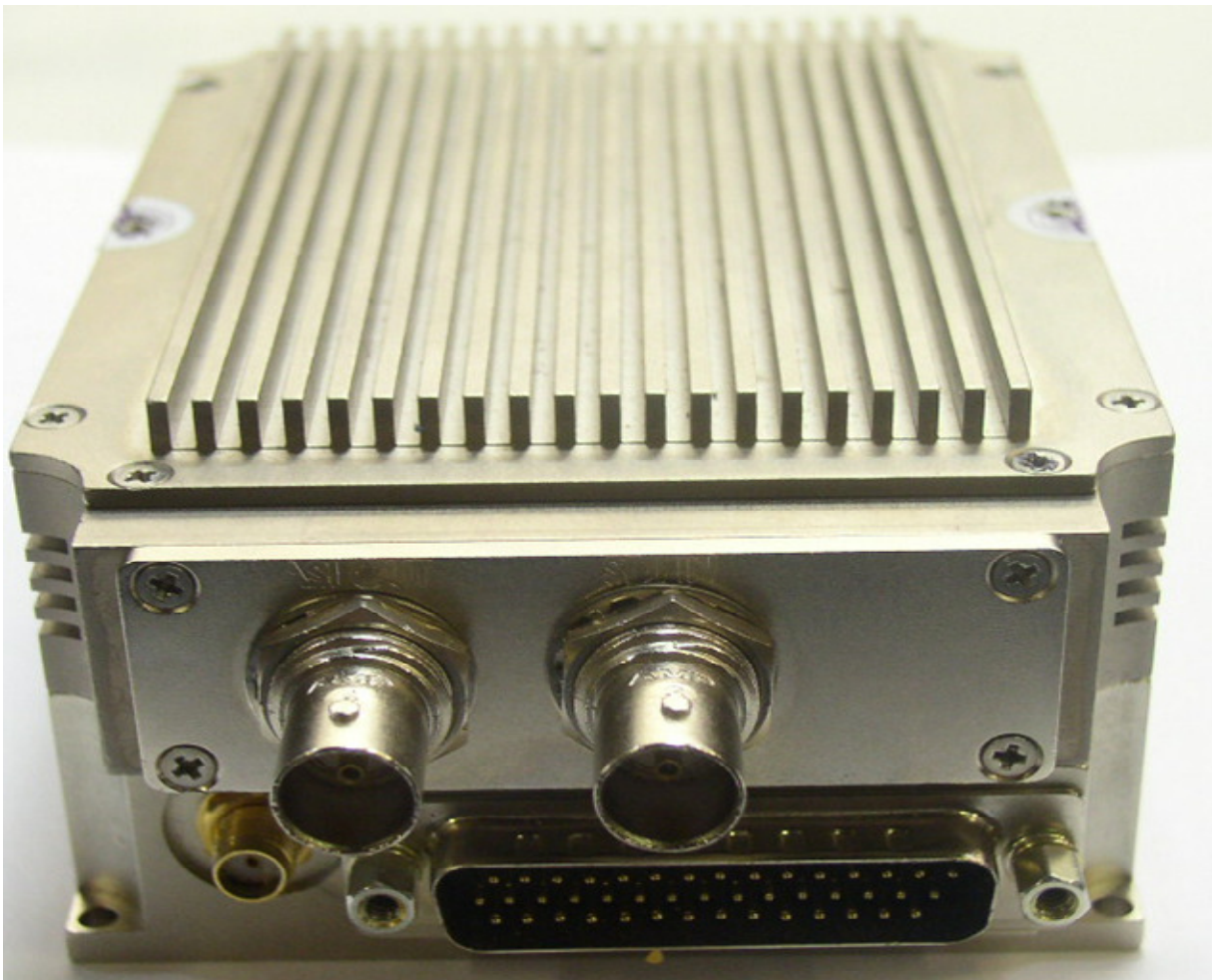
Figure 4 - Front side view with connectors