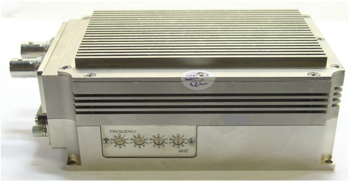
Figure 3 - Right side view with frequency select switches