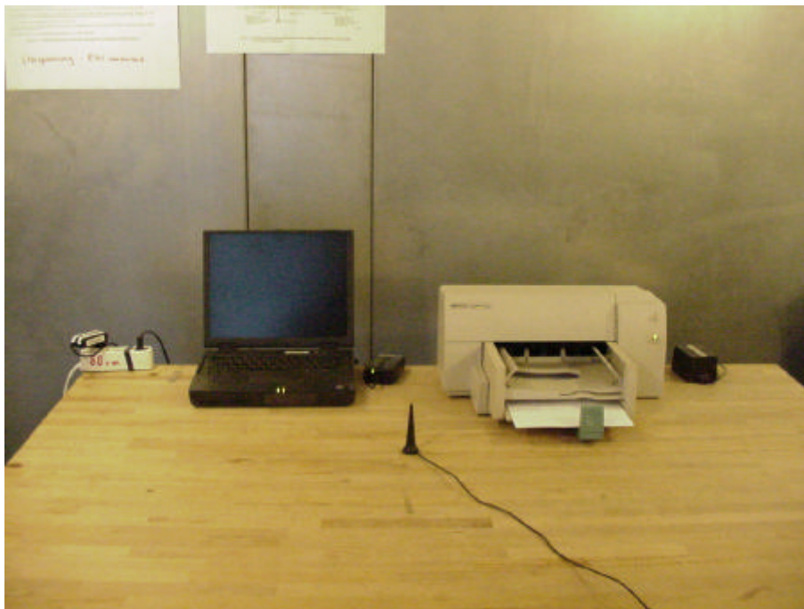
Picture 2 : Setup for the test "Conducted Emissions (AC Power Line)"