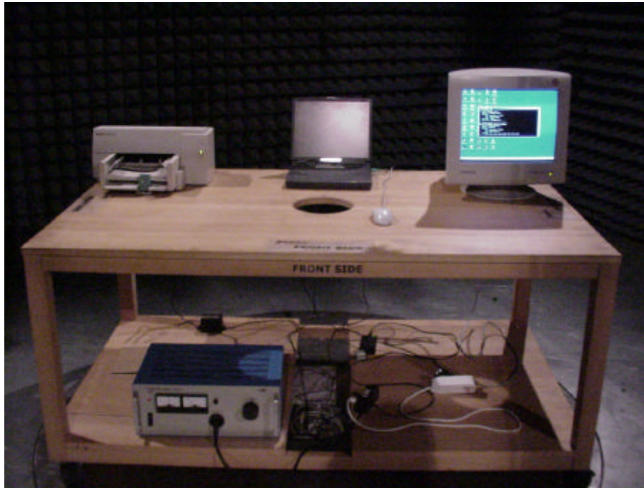
Picture 3 : Setup for the test "Spurious Radiated Emissions" f < 1\text{GHz}