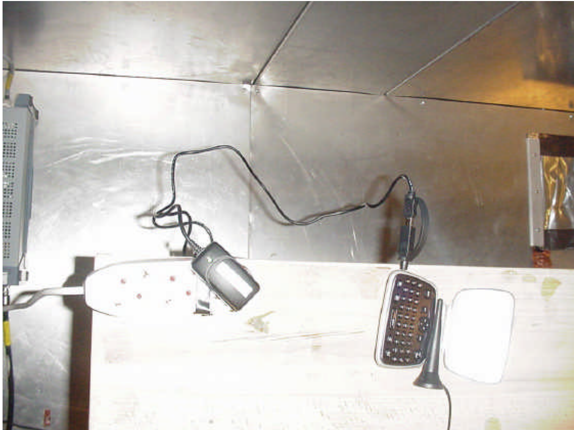
Photo3: EUT A (neochat) with PI charger