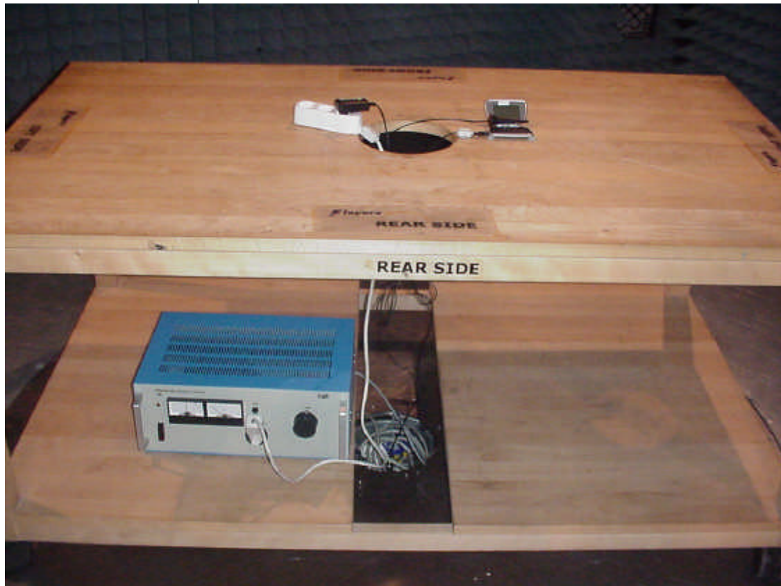
Photo2: EUT A (neochat) with Cincon charger