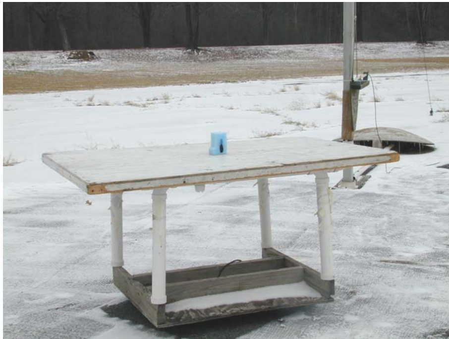
Appendix: DUT on OATS