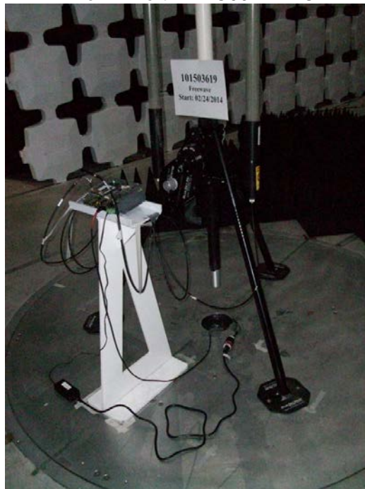
Two-RF Port – PRO902 MIMO

Note: Two antenna cables installed, one for each antenna for MIMO.