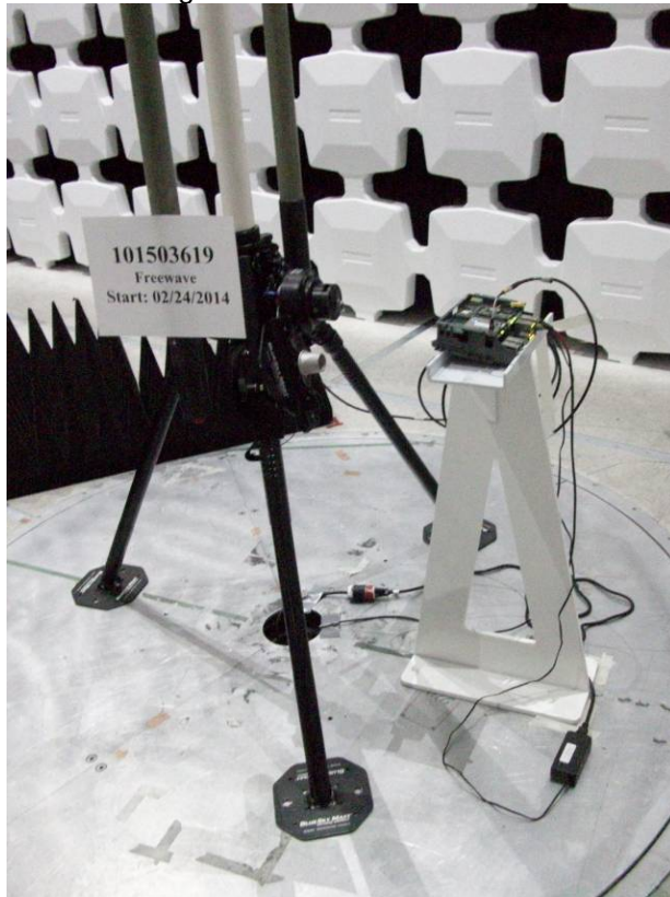
Single-RF Port – PRO902 SISO

Note: One antenna cable removed from one antenna for SISO