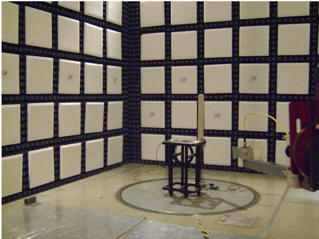
Test Setup for Radiated Emissions 15dBi gain antenna – 2GHz to 18GHz, Vertical