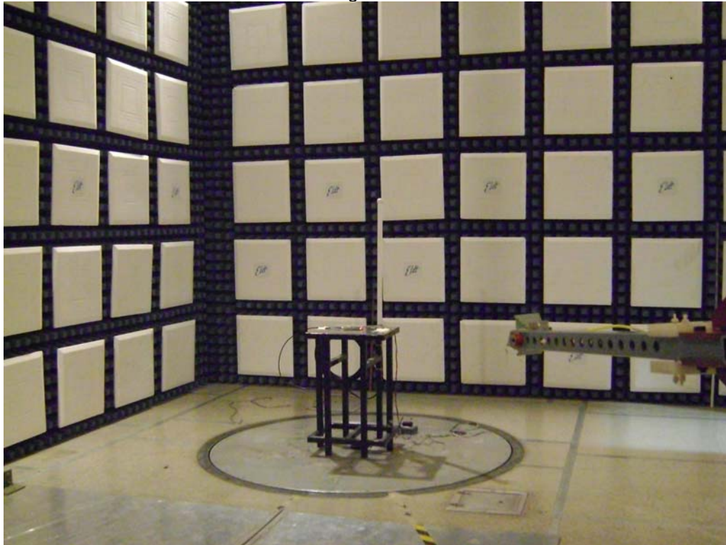
Test Setup for Radiated Emissions, 12dBi gain antenna – 2GHz to 18GHz, Horizontal Polarization