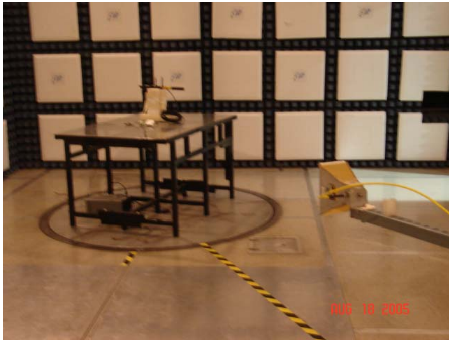
Test Setup for Radiated Emissions with the Yagi Antenna- Horizontal Polarization