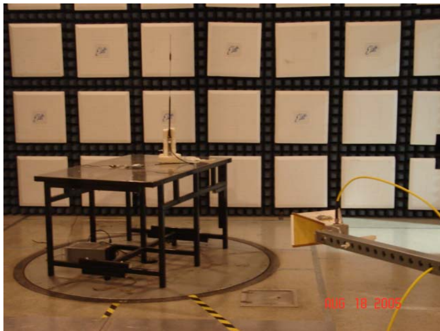
Test Setup for Radiated Emissions with the Omni Antenna - Vertical Polarization