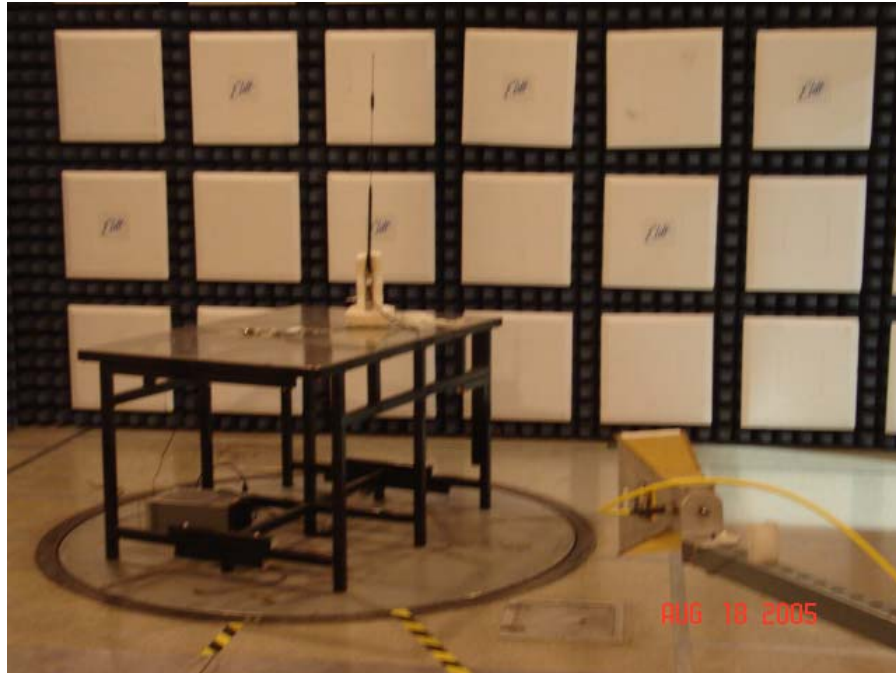
Test Setup for Radiated Emissions with the Omni Antenna - Horizontal Polarization