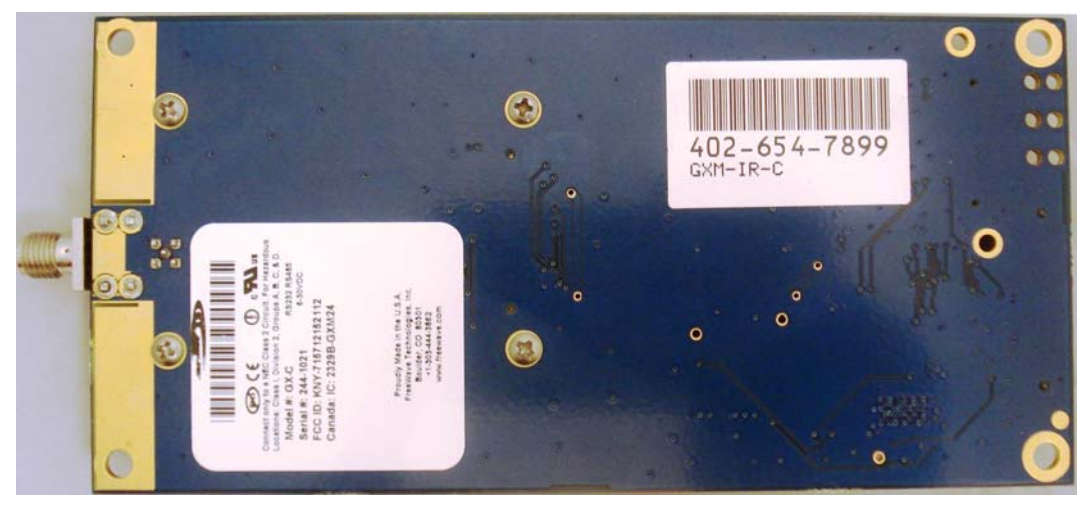
GX-C Top & Bottom (RS-232/422/485, 6-30VDC)