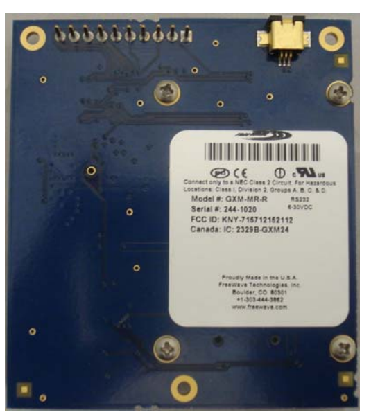
GXM-MR-R Top and Bottom (RS-232, 6-30VDC)