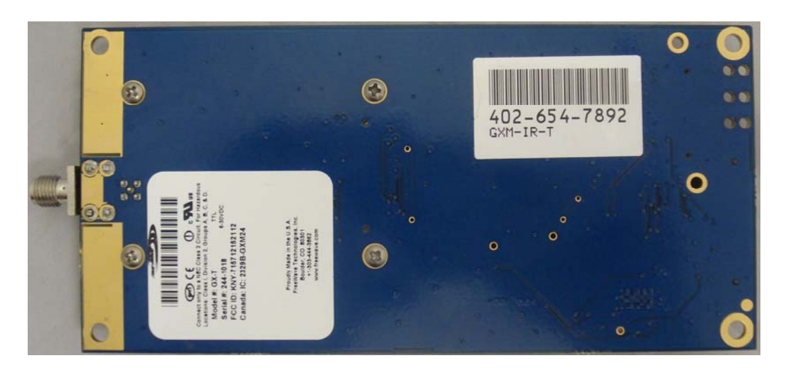
GX-T Top & Bottom (TTL, 6-30VDC)