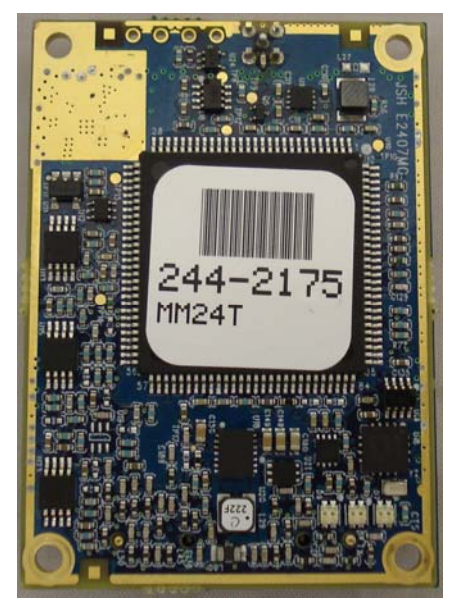
GXM-24 Top and Bottom (24-pin interface connector, 3.3-5VDC)