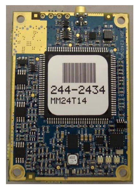
GXM-14 Top and Bottom (14-pin interface connector, 3.3-5VDC)