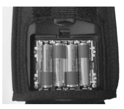
Figure 8. Unit with Battery Cover Removed

• To replace batteries, remove Belt Bridge from carrying case and then remove battery cradle cover