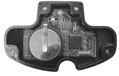
Figure 3. Sirius Wireless Link Opened for Battery Replacement