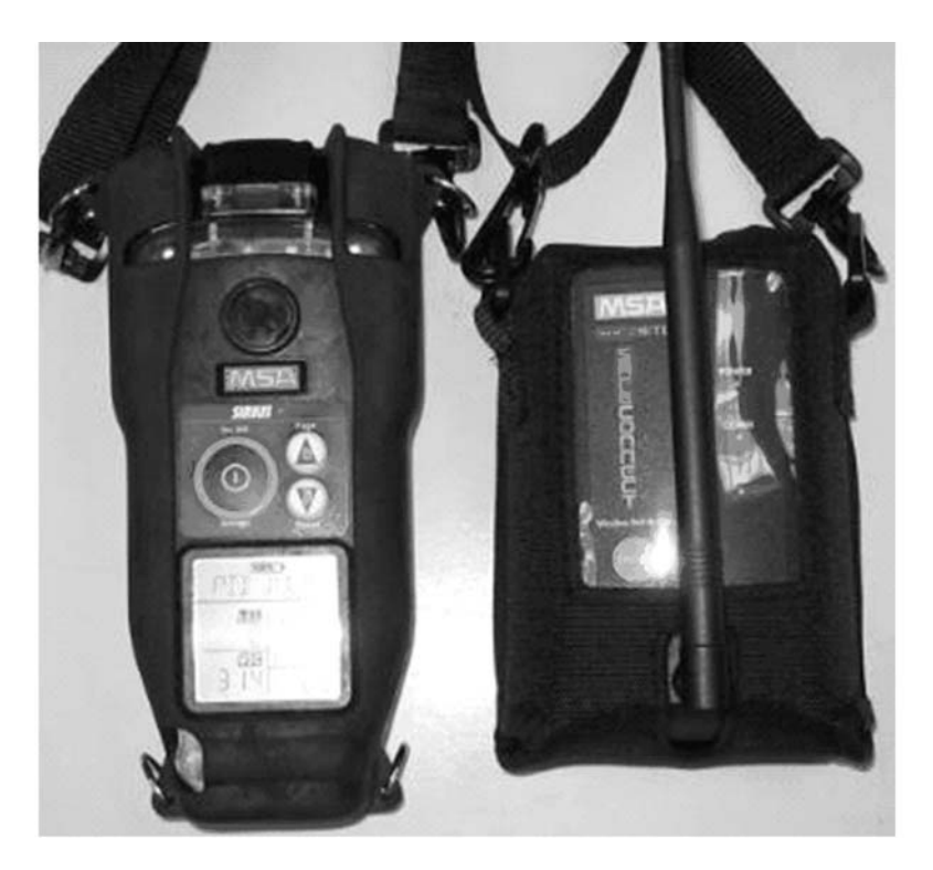
Figure 5. Sirius and Belt Bridge with Cradle Cover and Strap