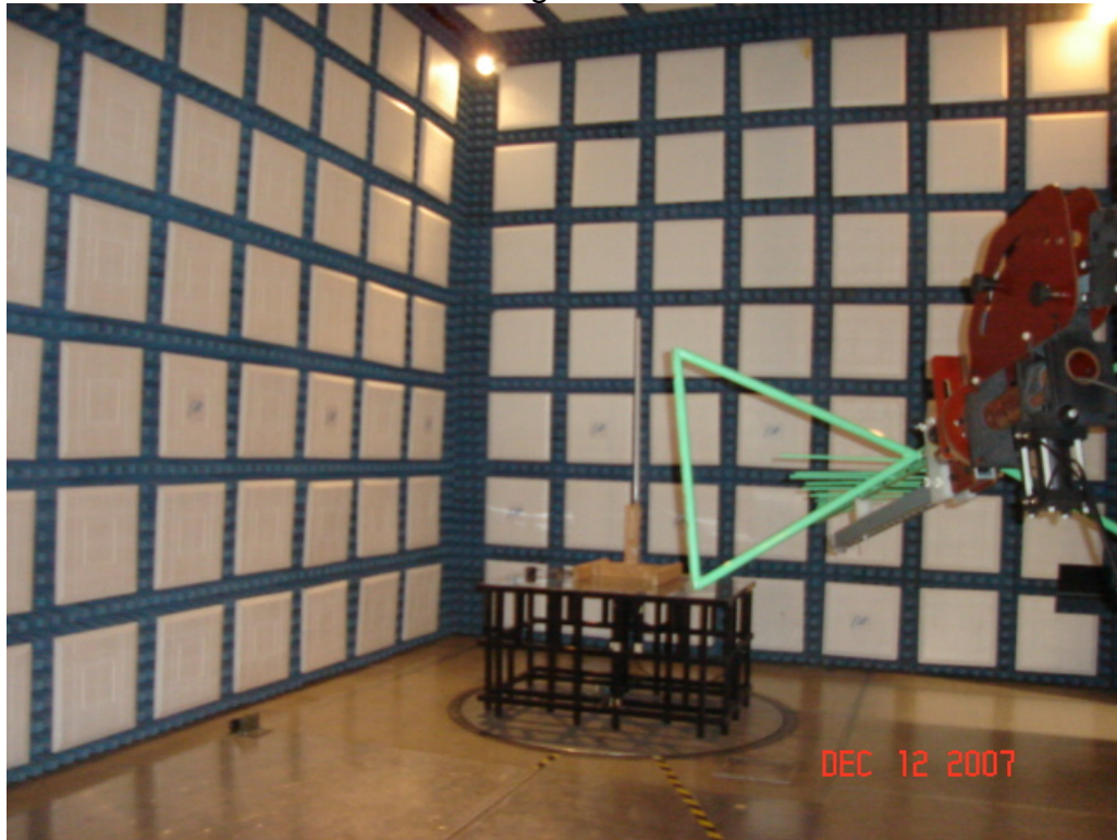
Test Setup for Radiated Emissions Omni Antenna – Horizontal Polarity