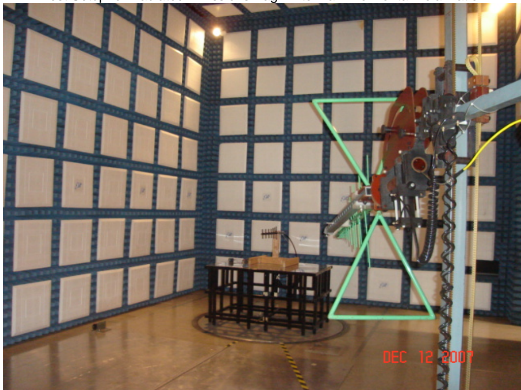
Test Setup for Radiated Emissions Yagi Antenna – Vertical Polarization