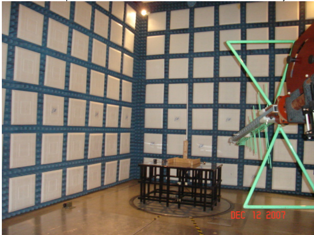
Test Setup for Radiated Emissions Omni Antenna – Vertical Polarity