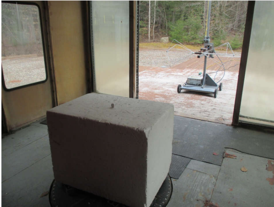
Test Setup, 30 MHz to 200 MHz, Horizontal Antenna Polarization