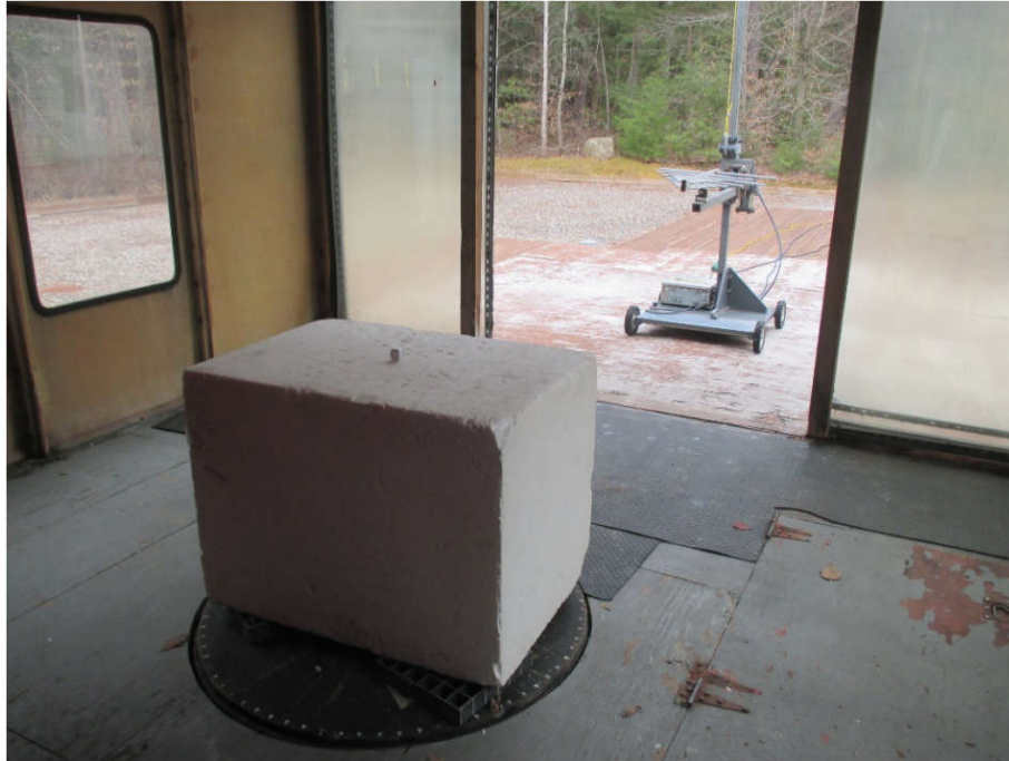
Test Setup, 200 MHz to 1 GHz, Horizontal Antenna Polarization