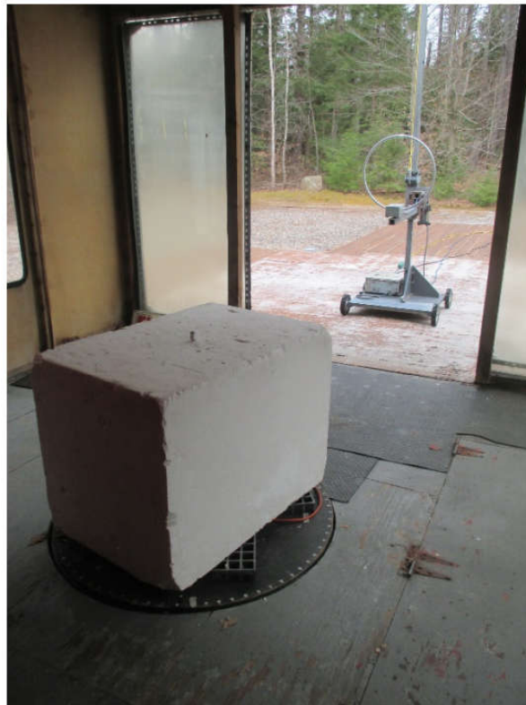
Test Setup, 9 kHz to 30 MHz