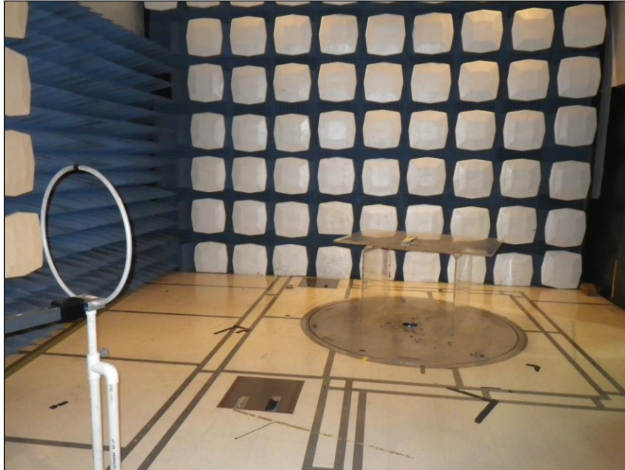
Photograph 3. Radiated Spurious Emissions, Test Setup, 10 kHz – 30 MHz