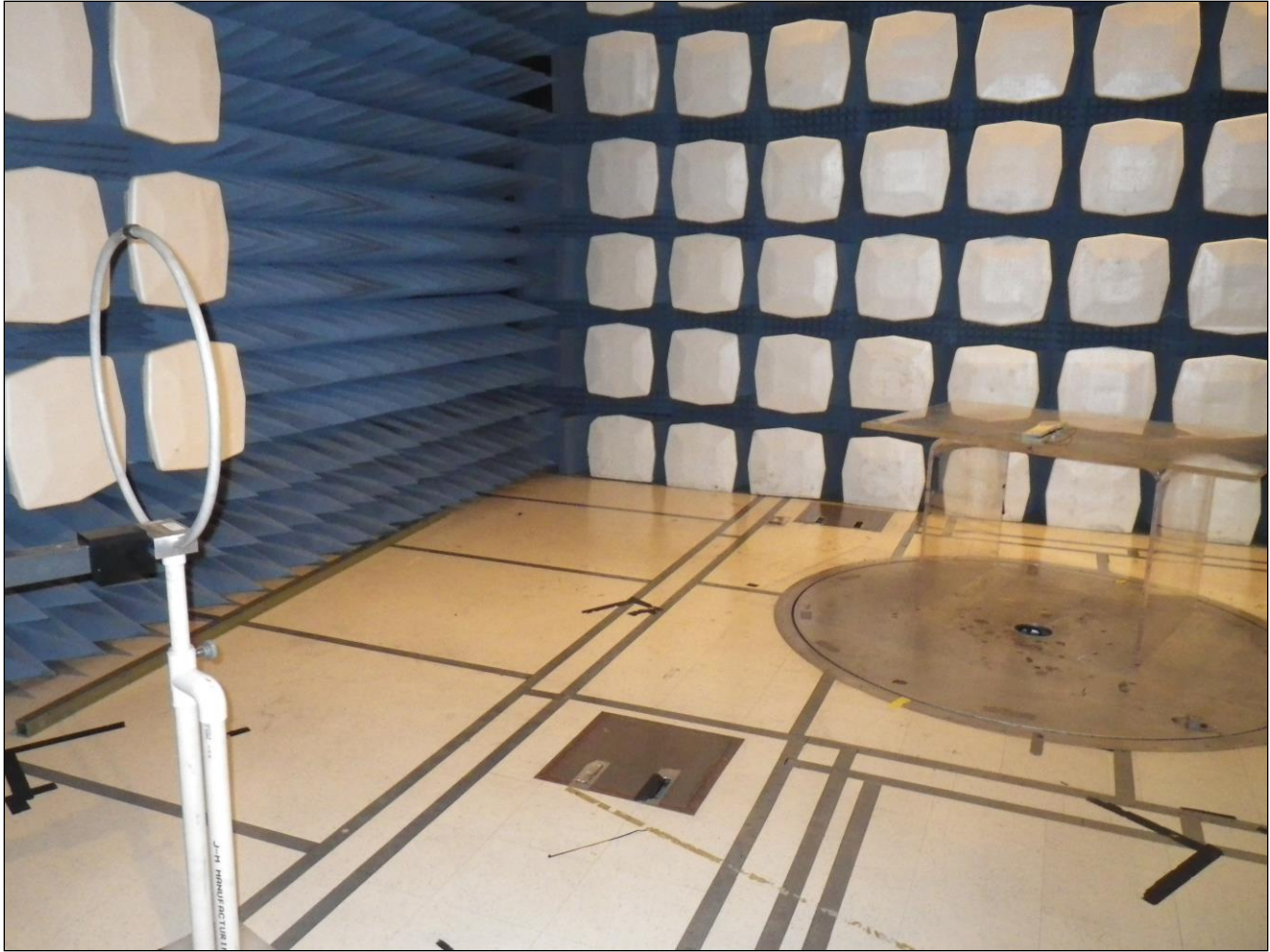
Photograph 2. Transmitter Unit, Field Strength, Test Setup