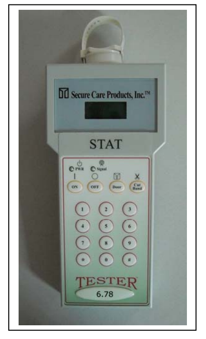
Figure 1. Transmitter-to-Tester Orientation

2. After the strap has been on the transmitter for at least one minute, position the 6.78MHz transmitter so that it is touching the display end of the Tester. (See Fig. 1 below for proper positioning of the transmitter relative to the Tester unit.)