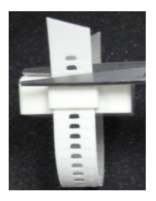
Figure 1.7 Cut strap as close to the latching mechanism as possible.