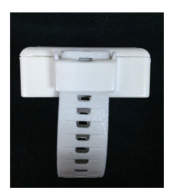
Figure 1.8 Ensure the strap does not go past the top two notches on the latching mechanism.