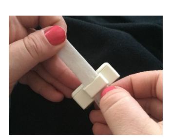
Figure 2.2 Slide pad back and forth in the transmitter latching mechanism to clean.