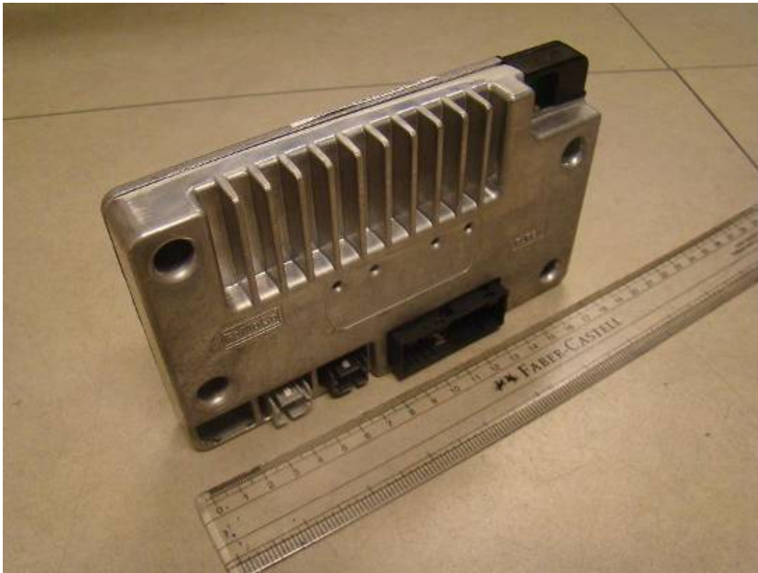
Figure 1: EUT – External view 1: Rear view