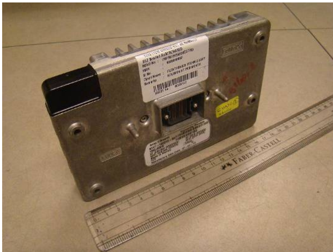
Figure 2: EUT – External view 2: Front view