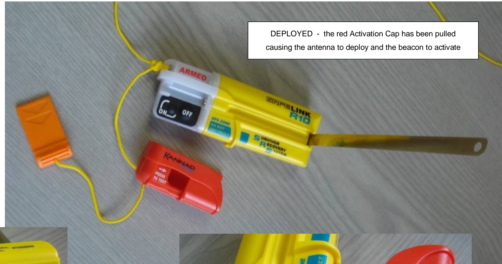
DEPLOYED - the red Activation Cap has been pulled causing the antenna to deploy and the beacon to activate