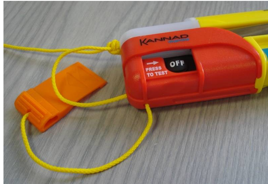
ARMED - the orange Arming Tab has been removed