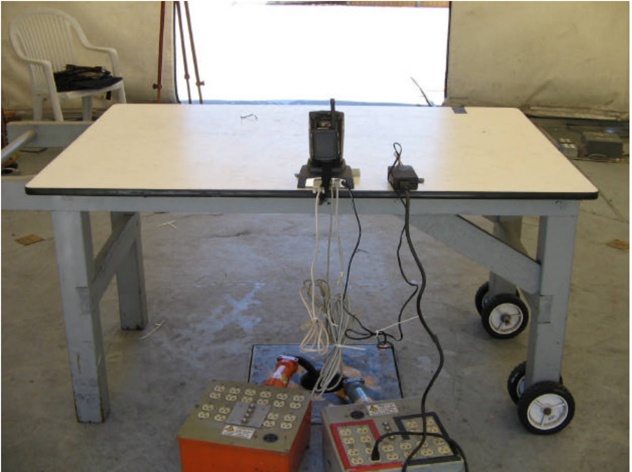
EUT in PDT docking station