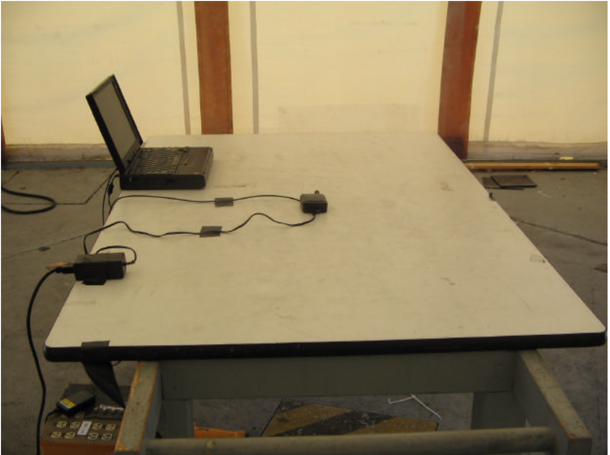
EUT connected to PC and powered from AC-DC adapter