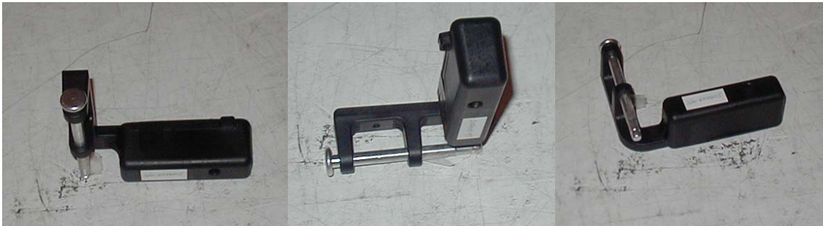
Photographs Showing The Tree Orientations Tested